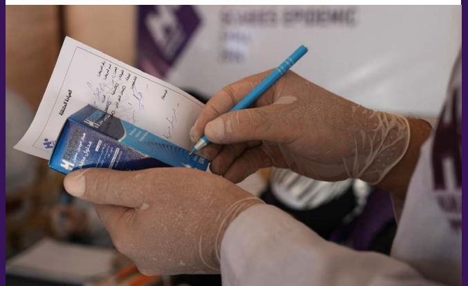
Medical supplies being organised and distributed.

Human Appeal Syria activated an emergency response to a scabies epidemic that occurred in Sham Al Hawa camp. The mobile clinic arrived at the camp, distributing hygiene kits to 32 families, examining 250 people and providing treatment to 138 people, as well as raising awareness of how to identify and prevent further cases of scabies.