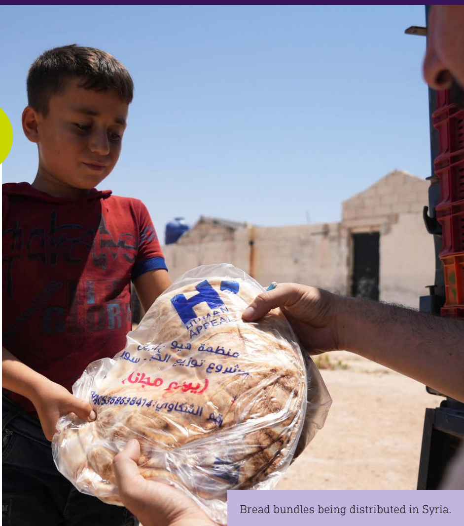
Bread bundles being distributed in Syria.

Human Appeal distributed bundles of fresh bread to 718 families in the displacement camps of Al Kuwait and Al Amal in Syria, ensuring families received nutritious food. This ongoing project will continue for the next three months, providing each family either one or two bundles of bread depending on their household size.