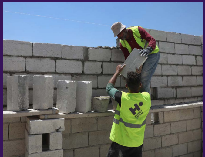
Homes being constructed in Al-Yasameen Village.

Human Appeal provided training to 150 families in northwest Syria on crop cultivation, care, and efficient harvesting techniques. This initiative aimed to enhance the local supply chain and improve food security for each participating family.