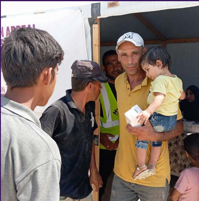
Leaving the clinic after receiving a diagnosis and medication.