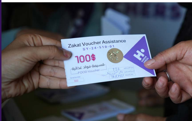
Zakat voucher being provided.

Human Appeal distributed Zakat vouchers worth $100 to 600 families that were affected by the earthquakes in 2023, spread across three displacement camps in northwest Syria. The families used these vouchers to secure foodstuffs for their monthly needs, such as rice, lentils, cooking oil, sugar, tea, eggs, and pasta.