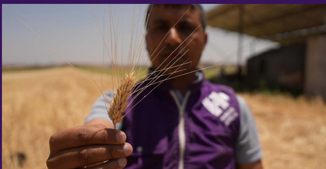
Freshly grown wheat in Syria.