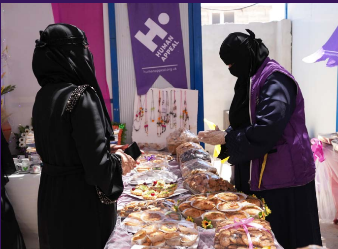
Pastries and accessories on display at the exhibition.