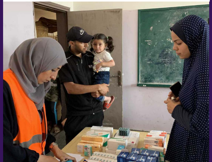
Medication being distributed at the mobile clinic.

Our mobile clinic provided health services to 160 families at the Rodolf Filter School.