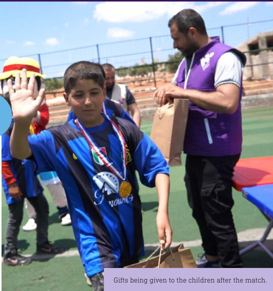
Gifts being given to the children after the match.

Human Appeal organised a friendly football match between the children of Al-Zohoor village and the children of Al-Tali'a displacement camp in Syria encouraging them to have fun and enjoy themselves for the day. Gifts were provided to the children involved in the football match.