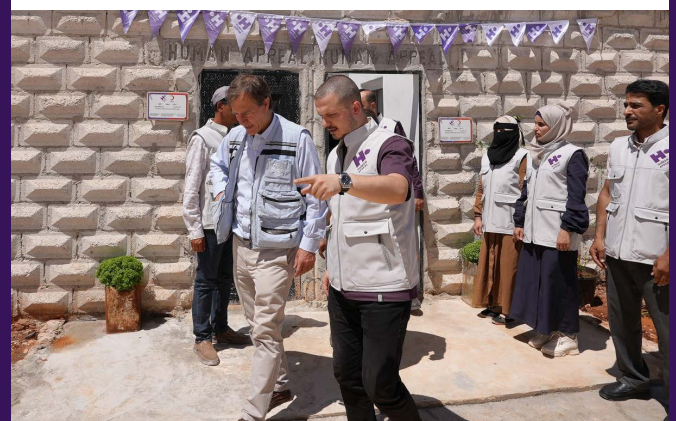
The UN group being led around Al - Yasameen Village