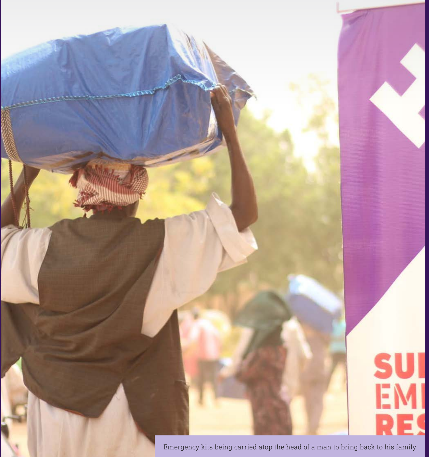
Emergency kits being carried atop the head of a man to bring back to his family.

After receiving 5,000 non-food item (NFI) kits for hygiene purposes from the International Organisation for Migration, stored in a warehouse in Sudan, Human Appeal has been distributing these kits to displaced families.