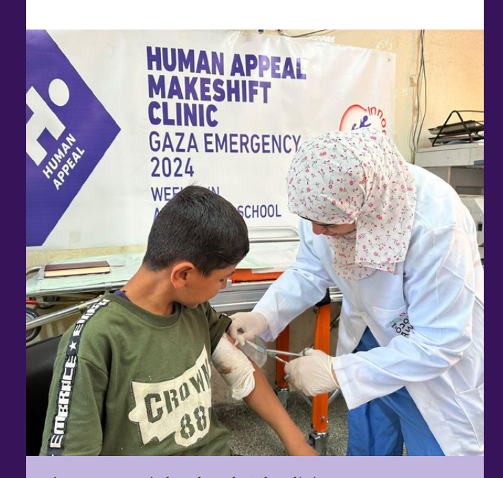
A young man is bandaged at the clinic.

Human Appeal's mobile clinic in Gaza has assisted a total of around 2,200 displaced people, visiting a different shelter school each week.