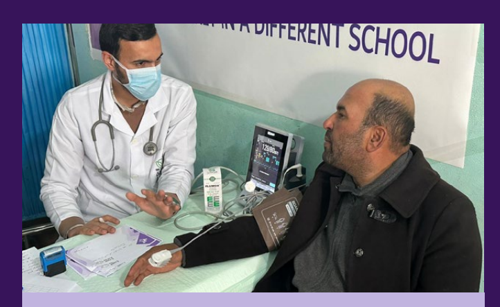
Blood pressure being check at the clinic.