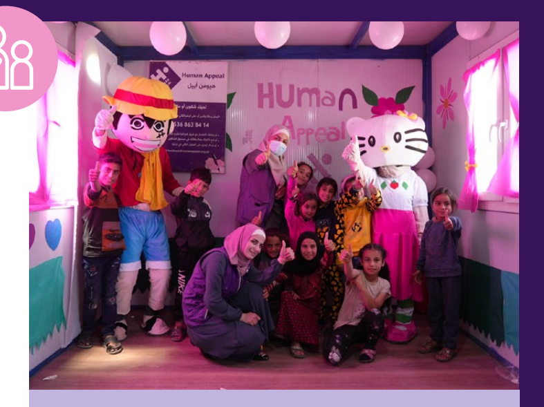
Recreational activities as part of the psychosocial support for the children.

Human Appeal has begun a camp management and protection project in the displacement camps of northwestern Syria, aiming to provide increased and equitable access to specialised services to thousands of children, as well as holding various awareness sessions. assistance and advice on parenting, and forming committees of volunteers. This project will support a total of 32,753 people in Syria.