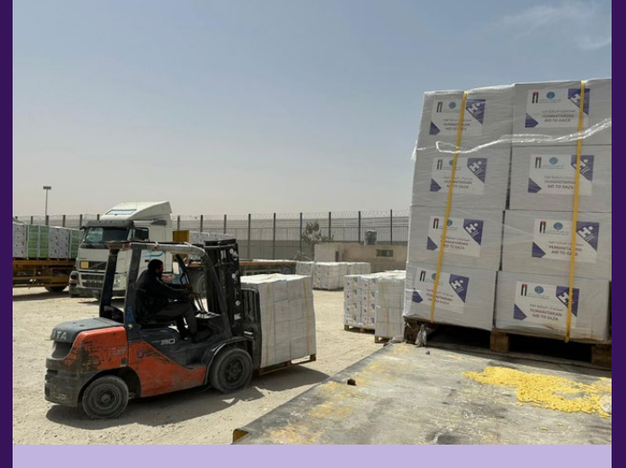
Food parcels being organised.