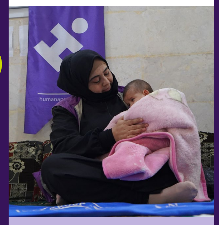
Baby being held following the vaccination.

During March, Human Appeal Syria provided vaccines to over 200 children each week in displacement camps in the Sarmada region, ensuring children in remote areas would be better able to resist diseases like polio, measles or smallpox, which could prove especially life-threatening as they lack access to healthcare.