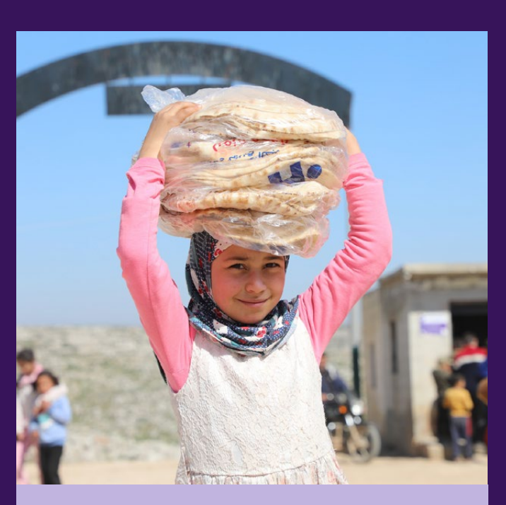
Child carrying bread back to her family.