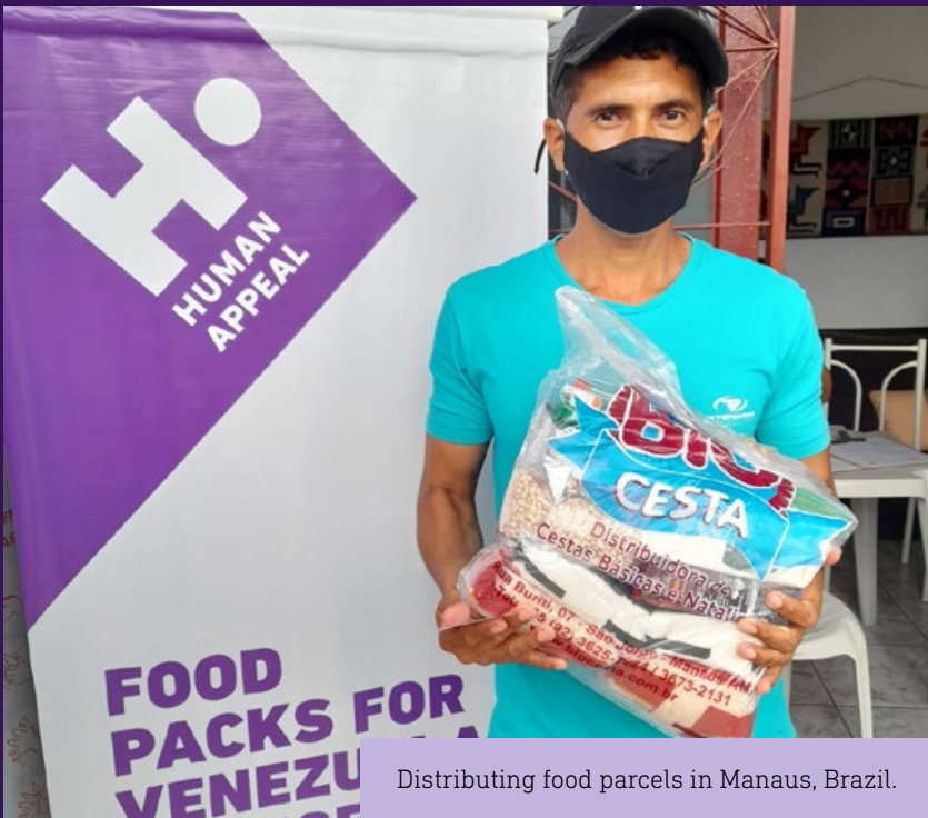
Distributing food parcels in Manaus, Brazil.

In December, we distributed food parcels to families in Manaus, Brazil, which has been drastically affected by the pandemic. Each family received nutritious food parcels to last a month, which included rice, sugar, milk, pasta, canned meats, flour, oil, beans, and coffee.