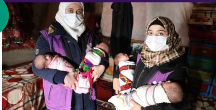
Human Appeal visited the quadruplets in their displacement camp in Northwest Syria.