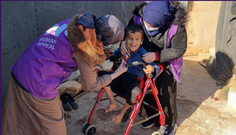
Joy from the children as our staff delivered their wheelchairs.