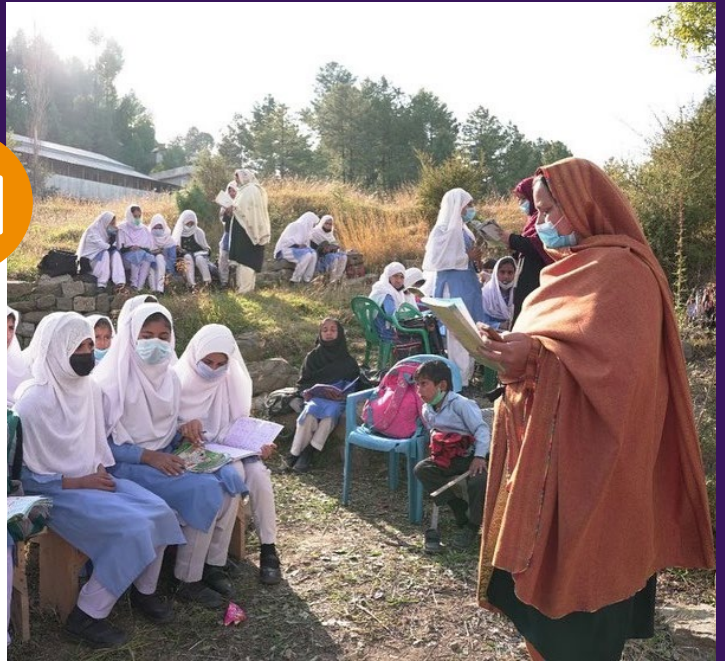
Girls study out in the open in Chira Topi.

A girls' middle school in Chira Topi, Pakistan-administered Kashmir, collapsed during an earthquake in 2005, leaving the girls of the area studying in a damaged, abandoned hospital. In December, our team visited the school to assess potential projects, and we're hoping to rebuild the school to create a safe environment for the girls of Chira Topi.