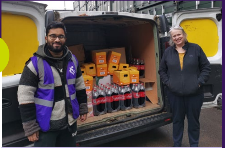
Human Appeal delivering food to Mosaic foodbank.

This month we delivered food items, such as tinned food, noodles, and flour to the Mosaic Church foodbank in Leicester to help the most vulnerable through winter.