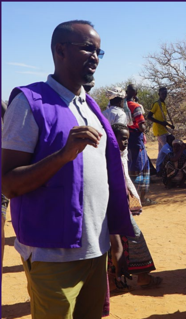
Our staff begin registering people for emergency help.