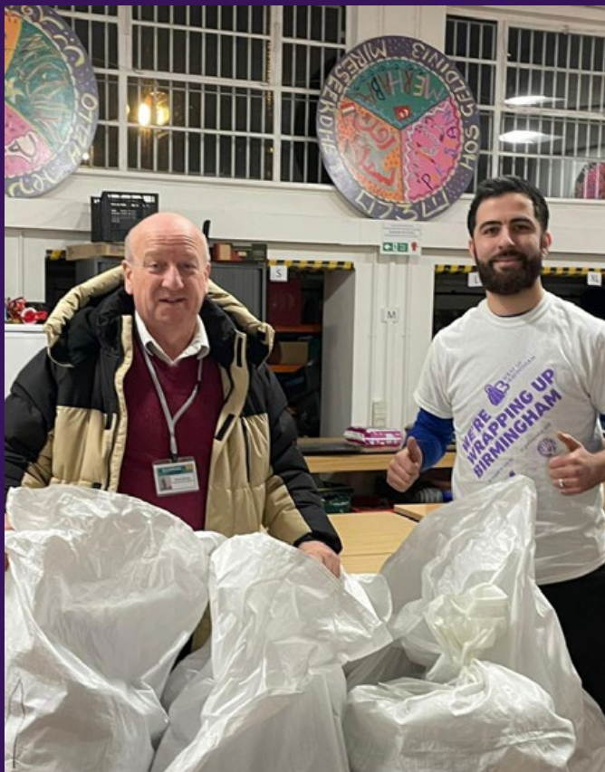
Our Wrap Up team worked incredibly hard to distribute your remaining winter coat donations in December.