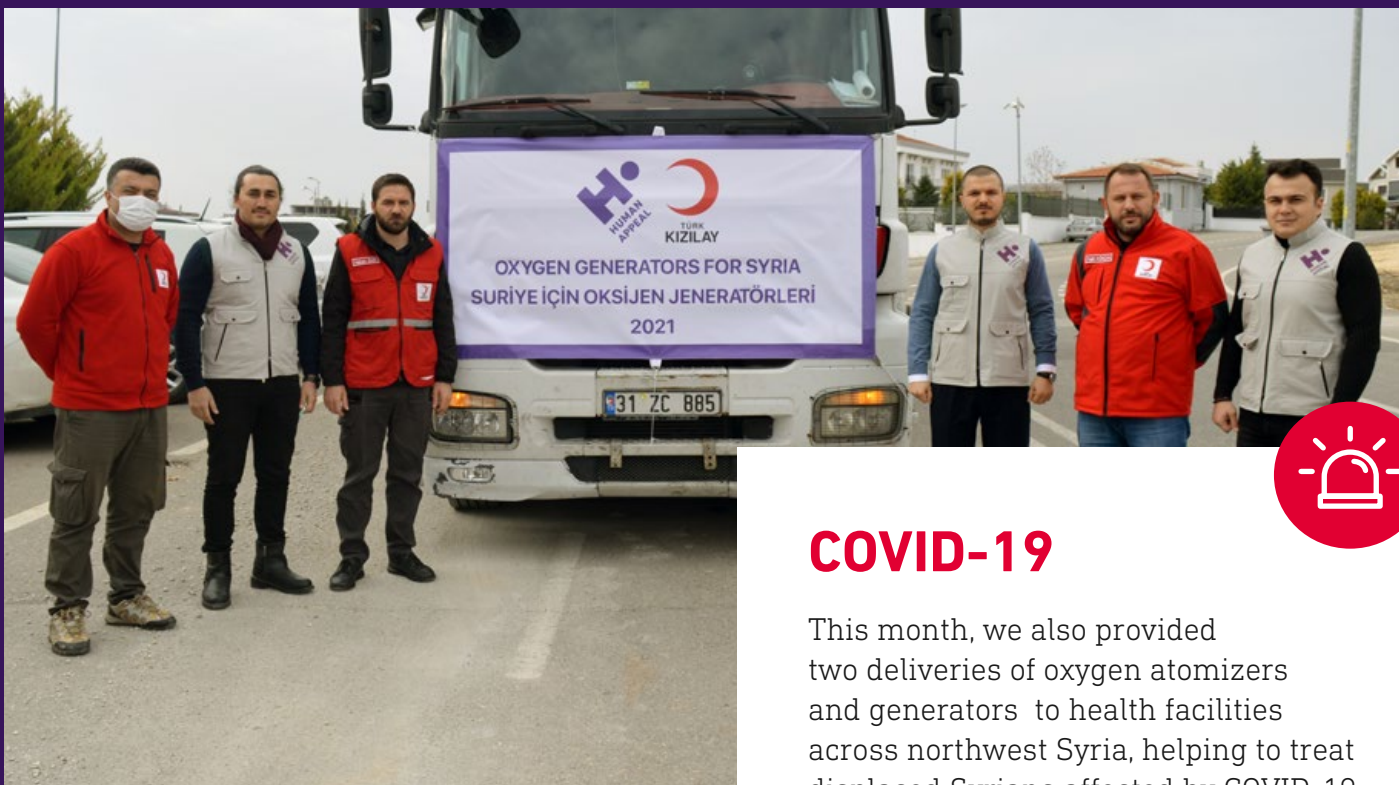
Human Appeal staff and partner agency the Red Crescent wave goodbye to the lorry delivering compressors to health facilities in Syria.