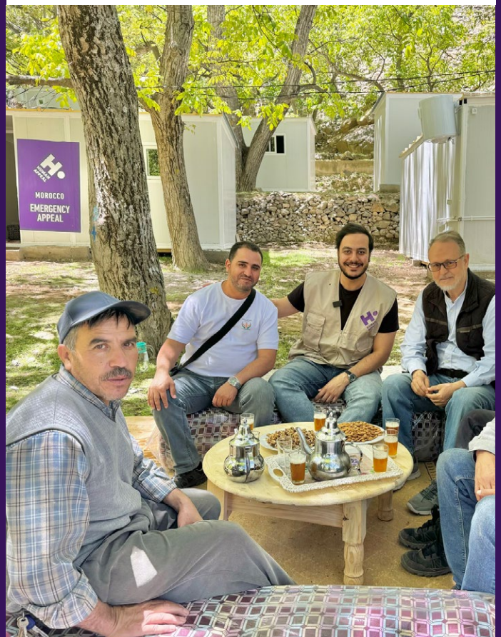
Drinks and a snack amidst the converted container homes.

We provided medical aid to 1,200 people in Morocco, offering free medical screening and referrals to the local hospital for those who struggled to afford access to healthcare.