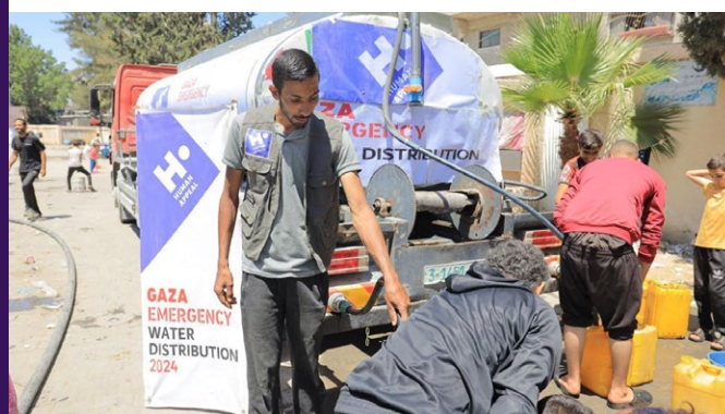
Water tanks being filled in Gaza.

Our team distributed 50,000 litres of clean drinking water to 1,100 displaced Palestinian families across six locations, Al Quds University, Arafat School for Boys, Arafat School for Girls, Sheikh Radwan - East Bridge, the area around Ahmed Yassin Street, and Amwas School, keeping them hydrated and healthy.