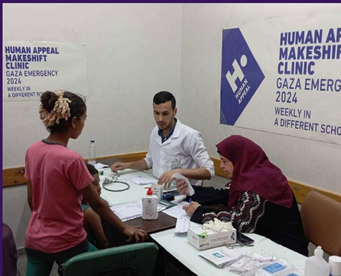
Medical discussions at the mobile clinic.