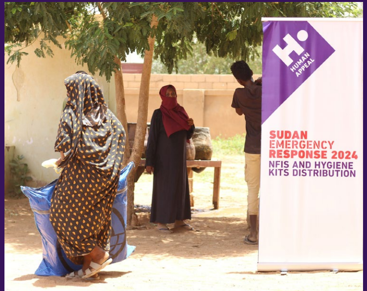
Hygiene kits being distributed in Sudan.