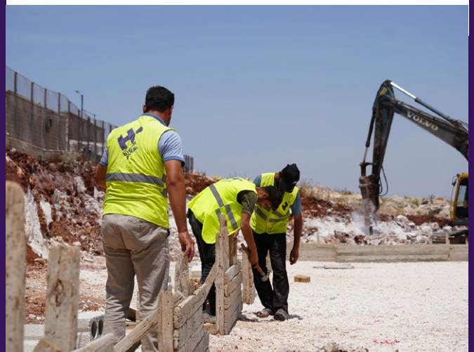
School in the very earliest stages of construction.

Human Appeal is in the process of constructing a new school in the village of Al-Zohoor, where many students struggle to access education. The school will provide children with the opportunity to learn and thrive.