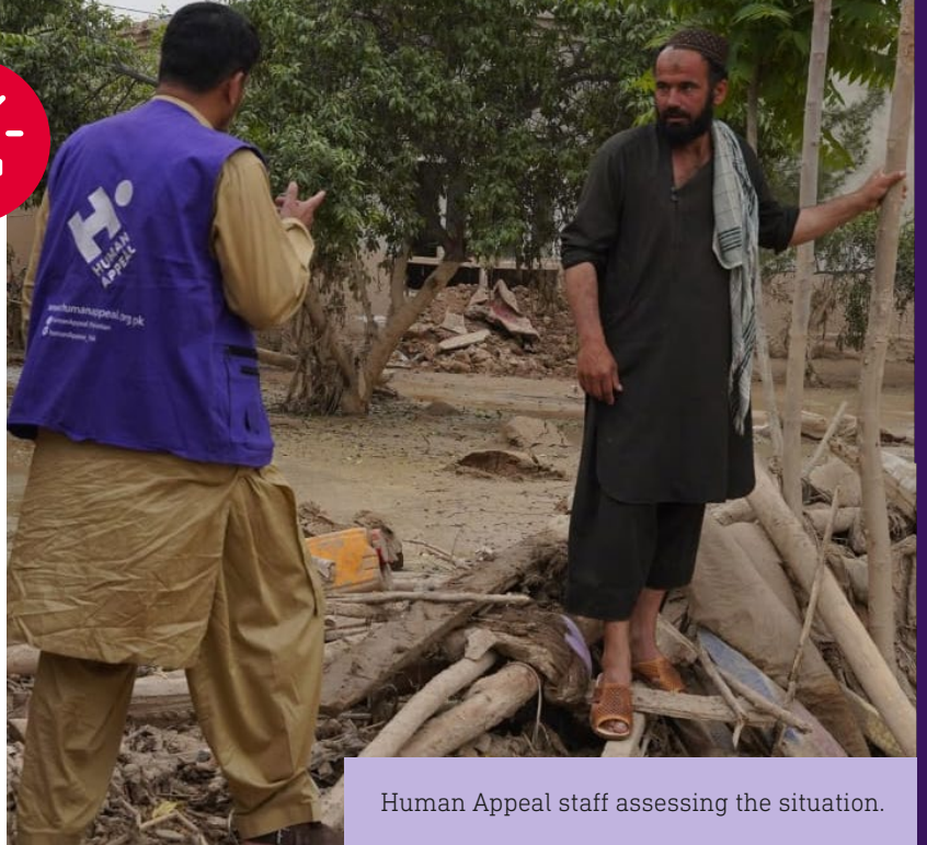
Human Appeal staff assessing the situation.

Following the devastating flash floods in Afghanistan, our team visited the Baghlan Province to assess the situation on the ground and contact those affected. This is in preparation to provide humanitarian relief to the affected population, supporting them in the wake of this disaster.