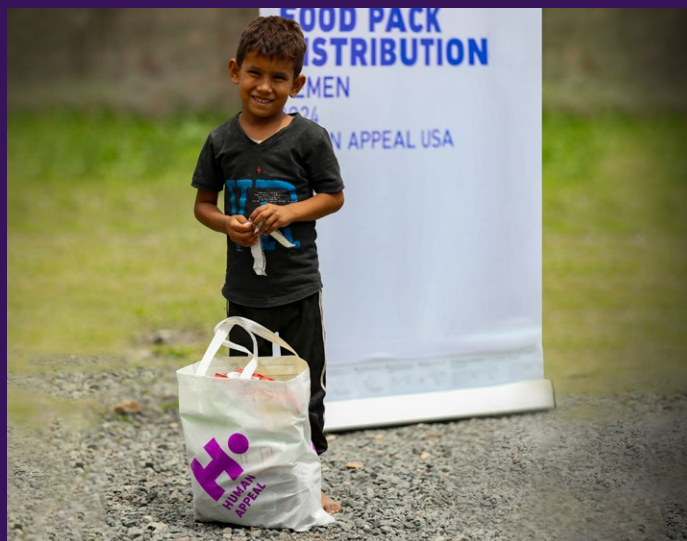
Child with food parcel in Yemen.