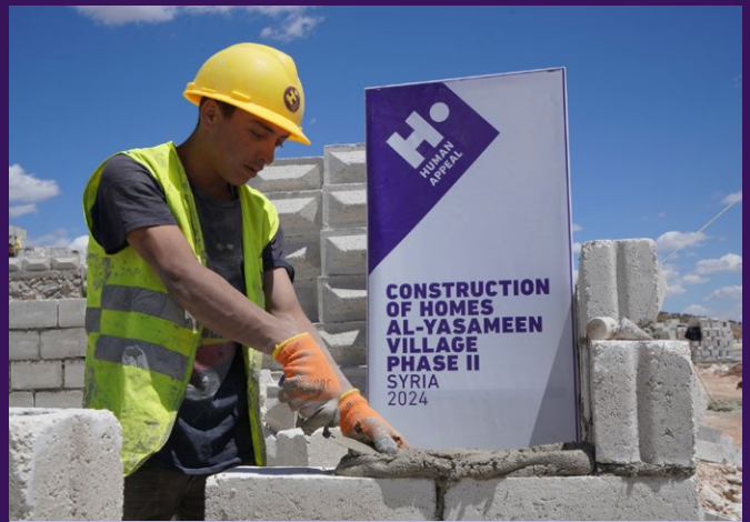
One of the 500 new homes being built.

In April, Human Appeal's Al Imaan Hospital provided treatment to a total of 10,960 patients , including delivering 375 babies and performing 96 C-sections .