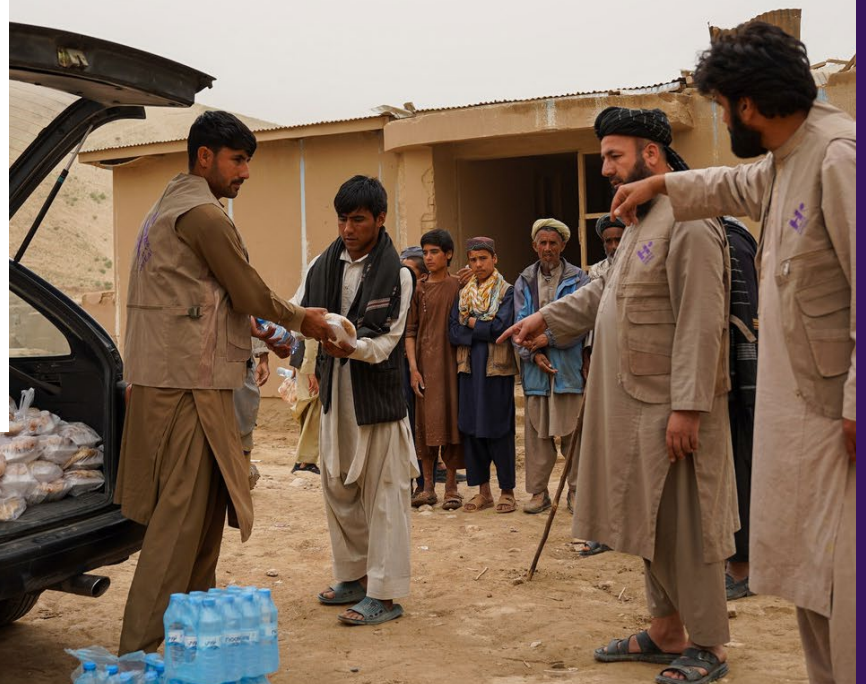
Hot meals and water distributed in Sheikh Jalal.

Our team distributed 500 hot meals in the village of Sheikh Jalal to families that have been affected by the floods. The flooding destroyed homes, livestock, and crops, leaving many families struggling to access kitchens or foodstuffs.