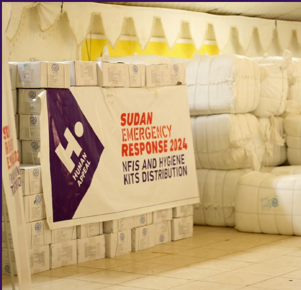
Hygiene kits stored in warehouses.