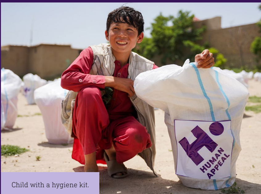
Child with a hygiene kit.

To ease the situation of those most affected by the flooding, Human Appeal distributed food packs to 100 families in the village of Tadamra Bala, Parwan Province. Each food pack is intended to last a family for a month and contains wheat flour, energy biscuits, vegetable oil, and pulses, helping the families stave off hunger.