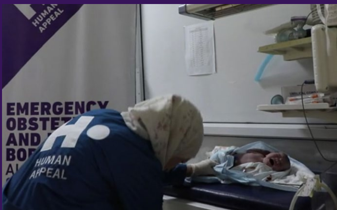
Baby being examined at Al Yasameen.