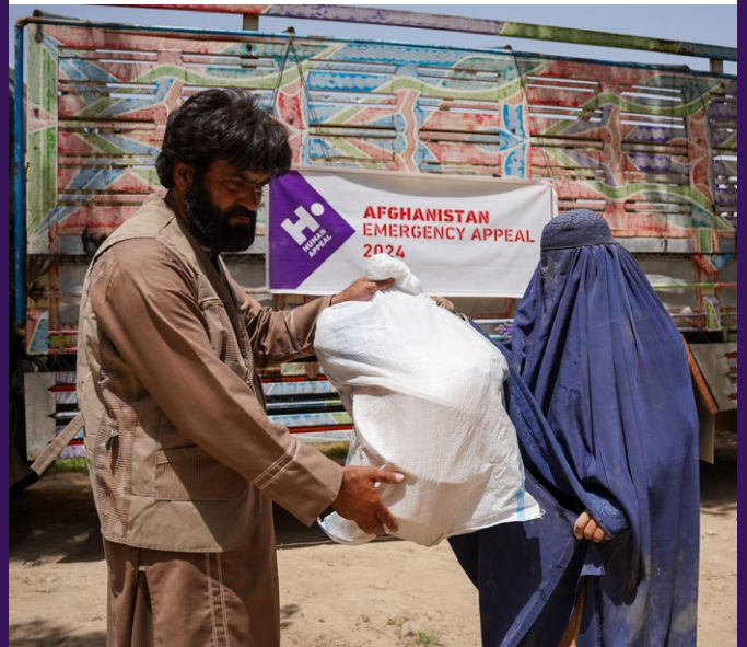
Kitchen sets bundled in a bag being distributed in Afghanistan.

The floods that struck Afghanistan have left many families without access to kitchens, utensils, or cooking implements. Human Appeal distributed 552 kitchen sets , ensuring that the families would have all they needed. Each set contains bowls, a tea kettle, plates and cups, a knife, a ladle, a frying pan, a fruit basket, a food container and a mosquito net.