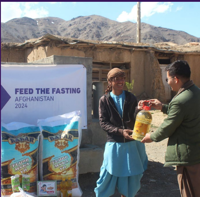
Food parcels being distributed in Afghanistan.