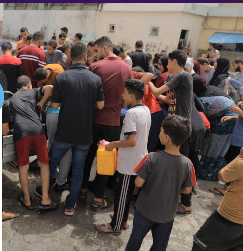
Clean drinking water provided via water truck.

Our team distributed 50,000 litres of clean drinking water to 1,100 displaced Palestinian families across five shelter schools, Salah Al Deen School, Al Mamoonya School, New Gaza School, Al-Alaliyah School, and Adnan Al Alaim School, keeping them hydrated and healthy.