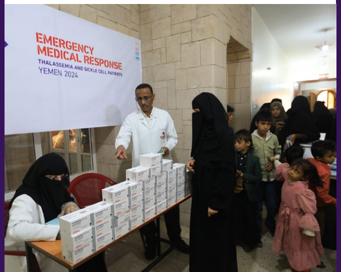
Medical supplies being organised and distributed.

In Sanaa, we distributed vital medical supplies to 2,700 patients suffering from thalassemia and sickle cell disease, addressing the critical shortage of medication and supplies in hospitals and healthcare centres.