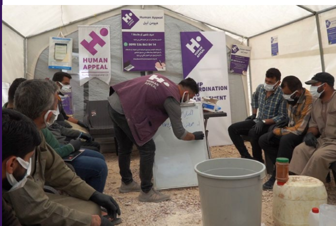
Vocational training session underway in Syria.

Human Appeal provided 200 people in Al-Zohoor village with vocational training, both men and women. 40 individuals were trained in mobile phone maintenance, 40 in accessory making, 60 in pastry making, and another 60 in detergent production.