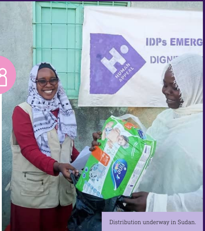
Distribution underway in Sudan.

We provided bottles of baby milk and packs containing nappies to mothers at the Arkawet, Alshima and Alnahda centres for displaced families in Sudan. Additionally, we distributed 70 dignity kits to women and girls at the Arkawet centre, containing essential hygiene materials such as toothpaste, soap, toothbrushes, and sanitary pads, among other necessary items for hygiene.