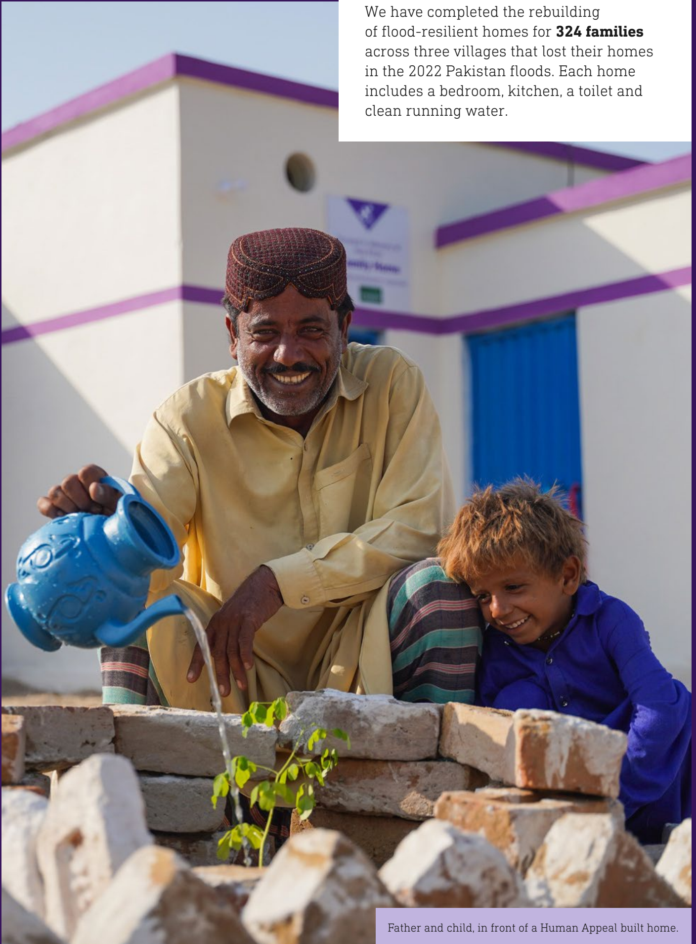
Father and child, in front of a Human Appeal built home.

We have completed the rebuilding of flood-resilient homes for 324 families across three villages that lost their homes in the 2022 Pakistan floods. Each home includes a bedroom, kitchen, a toilet and clean running water.