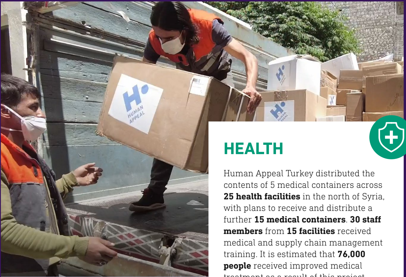
These medical supplies are urgently needed by Syrian hospitals.