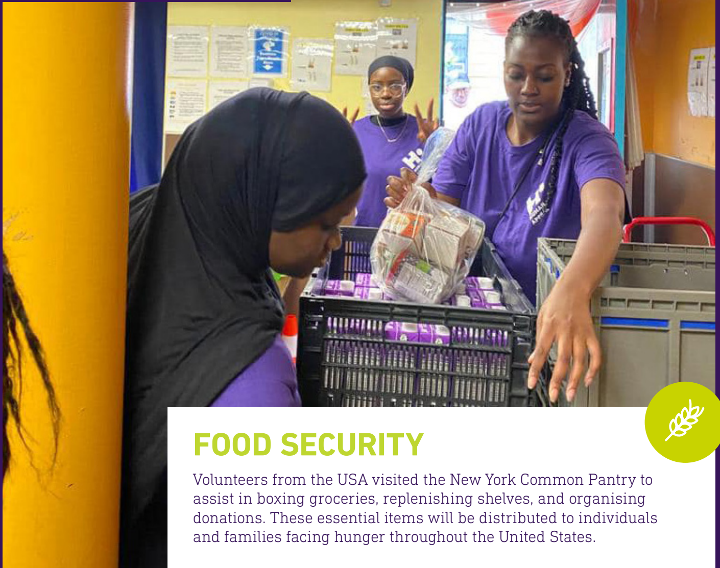
Volunteers boxing groceries at the pantry.