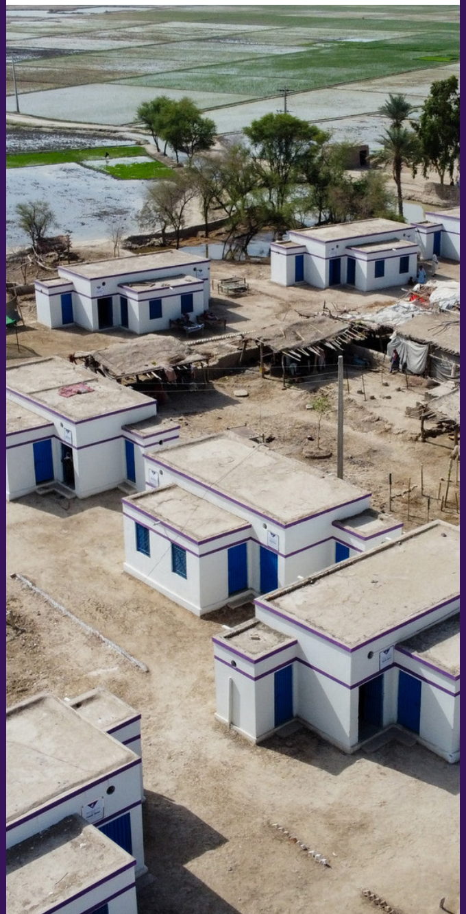
The first newly built homes of Ghulam.

Human Appeal has completed the first phase of constructing homes in the village of Ghulam Hussain Chandio, providing those who lost their homes in the floods of 2022 with new homes that are more flood-resilient. We have built 28 and delivered them to families. Each home comes with attached toilets, fans and light bulbs, giving them both dignity and comfort. We hope to be able to build over 500 of these homes in the coming months.