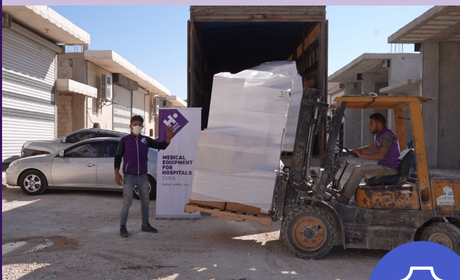
Medical supplies being stored for distribution.