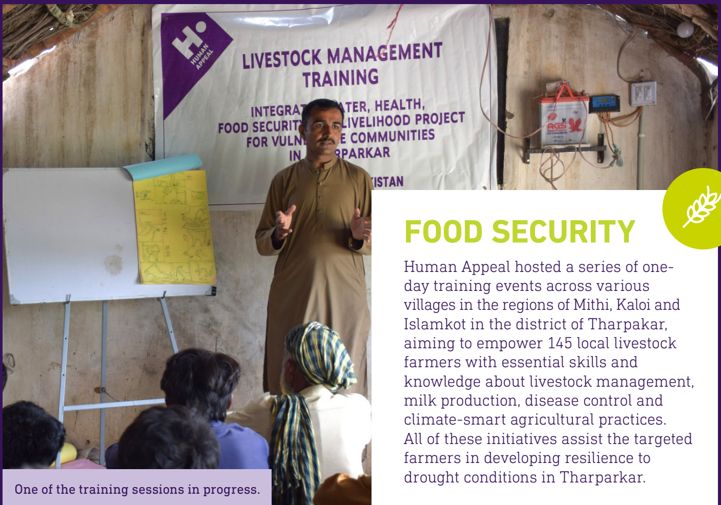
One of the training sessions in progress.