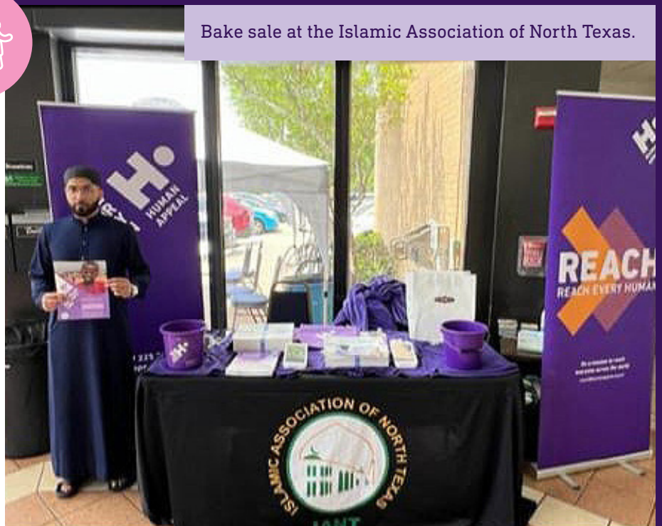
Bake sale at the Islamic Association of North Texas.

Volunteers and staff hosted a bake sale at the Islamic Association of North Texas to help raise funds for our Orphan Sponsorship programme.