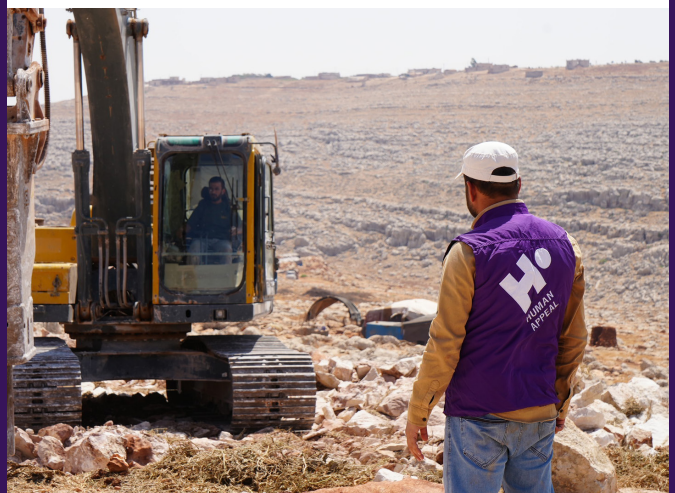
Human Appeal staff watching construction begin.

The construction of Al Yasamin Village in Ma'arat Misrin has commenced, representing another effort by Human Appeal to provide shelter for displaced Syrian families. Upon completion, Al Yasamin Village will consist of 250 housing units, each containing four houses, totalling 1,000 homes.