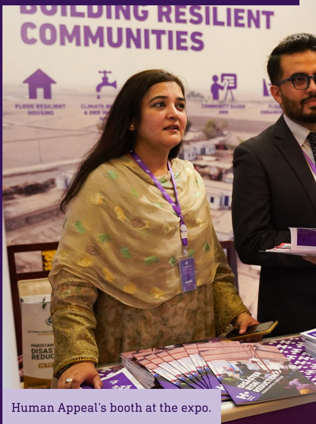
Human Appeal's booth at the expo.