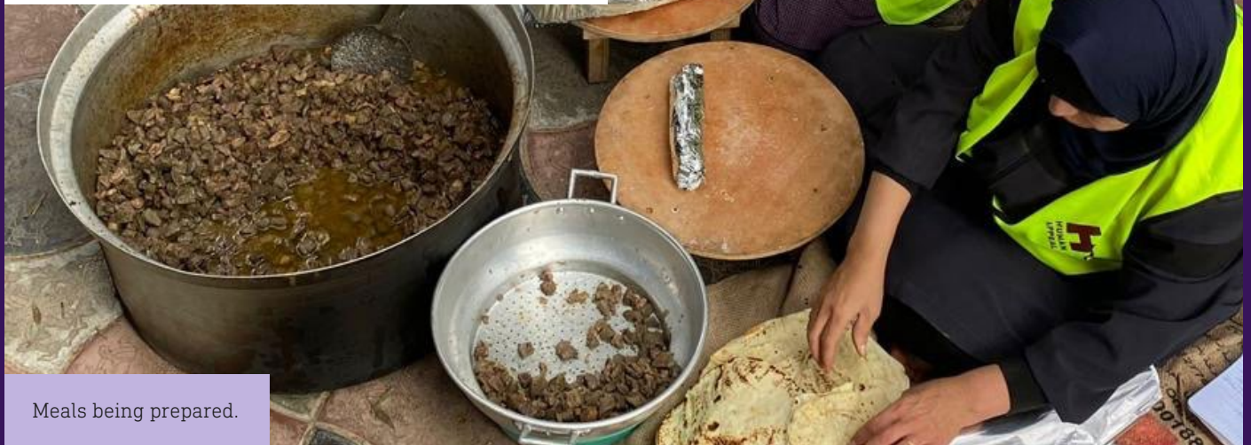
Meals being prepared.

In our emergency response efforts, we provided vital support to new mothers in Gaza by distributing hundreds of meat-containing sandwiches across three hospitals . This initiative aimed to replenish their energy during the challenging postnatal period.