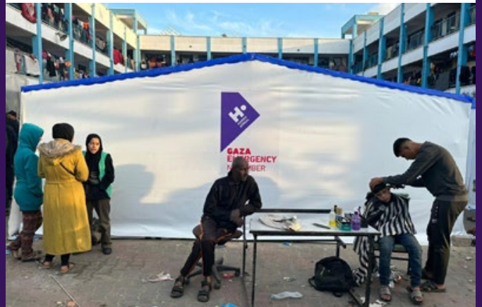
Tents set up in the courtyard of a school.

In another pioneering effort, Human Appeal stands out as one of the first and only charities addressing urgent needs in Gaza. Going beyond daily aid provision on the ground, we lead the way in constructing and installing durable tents in all 29 UN shelter schools across Gaza.