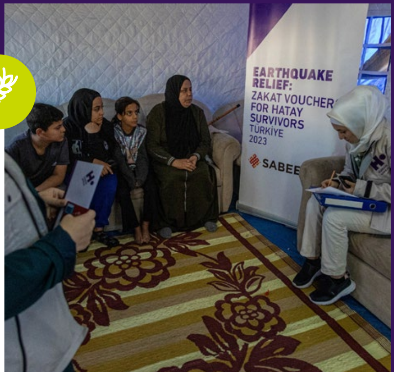
Paperwork being filled prior to voucher distribution.

The aftermath of the earthquake that hit Syria and Turkey earlier this year continues to linger. In Hatay alone, over 600,000 people are grappling with homelessness, triggering economic distress that forces families into a struggle to afford basic necessities and nutrition. In response, Human Appeal stepped in and distributed food vouchers offering crucial assistance in purchasing essential food items.