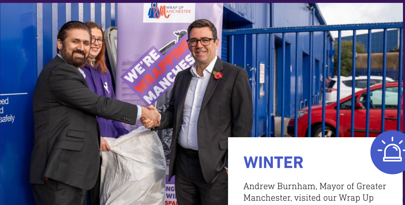
Navendu Mishra delivering a coat to Wrap Up.

Navendu Mishra, MP for Stockport, visited the Wrap Up station at Stockport Safe Store, run by Human Appeal.