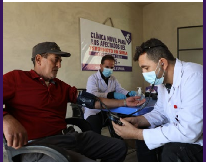
Members of the mobile clinic examining a patient.

Operating in displacement camps and remote areas of northwestern Syria, our mobile clinic is making a difference. With a dedicated general physician attending to around 80 patients daily, our pharmacy ensures free medicine distribution. Additionally, a community health worker addresses malnutrition in women and children by offering vitamins and nutritional supplements, along with a specialised gynaecology clinic. Over the course of the month, the mobile clinic has reached 1,925 patients .