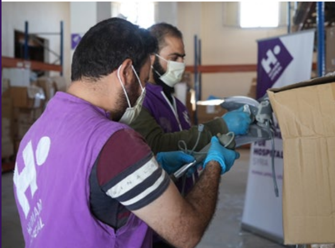
Medical supplies being checked prior to distribution.

Containers of urgently needed medical supplies have been received for distribution to 50 health facilities across Syria. As the conflict persists, these supplies are crucial for providing essential healthcare services to those in need.