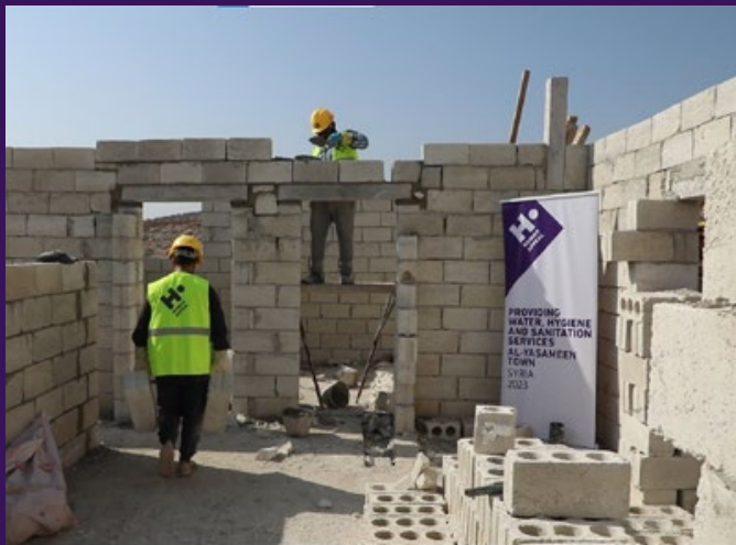
Houses under construction at Al-Yasameen.