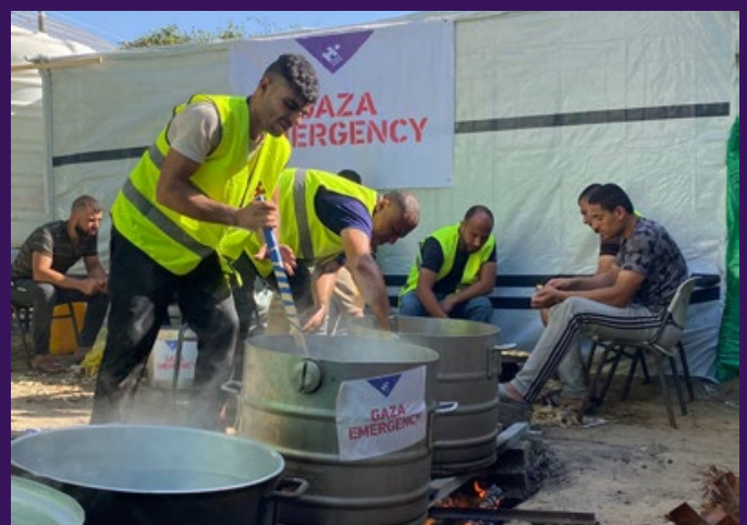
Hot soup being stirred in Gaza before being poured.

As one of the few organisations capable of navigating the intricate challenges of the region, we persist in our vital mission to support and uplift the affected communities. Since the escalation began in October, Human Appeal has been able to assist over 310,370 people in Gaza, thanks to the generous support we have received.