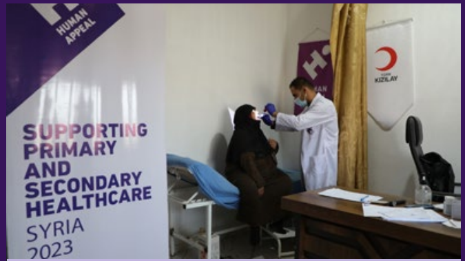
Healthcare being administered at the centre.