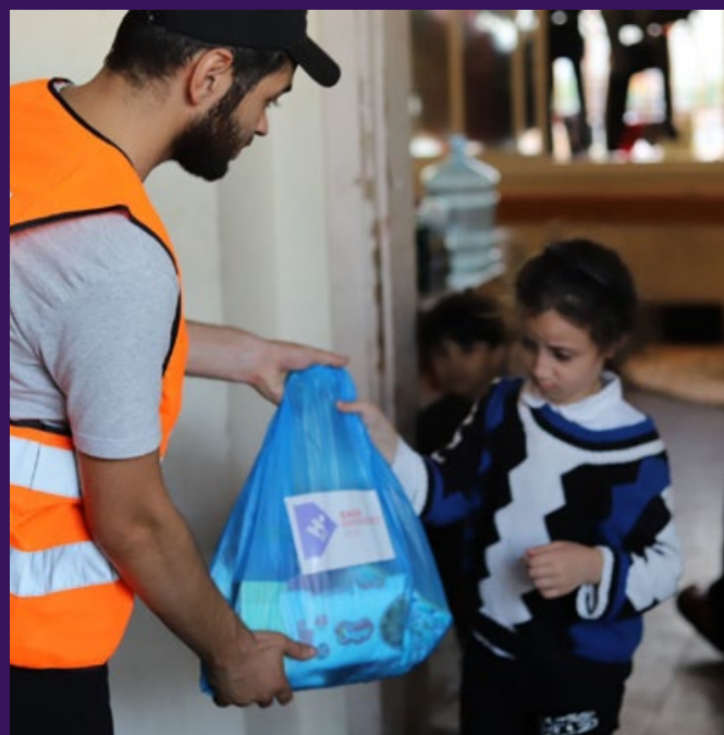
Our team delivering vegetable parcels to people during the emergency.

The dire humanitarian situation in Gaza has persisted for over two months, characterized by devastating conditions. The bombings have claimed thousands of lives, and the crisis is compounded by a nearly complete blockade that hampers the flow of essential humanitarian aid. Despite facing formidable challenges, our dedicated local staff in Gaza persistently carry out their duties every day. Even in the face of personal losses of family and friends during the conflict, they remain steadfastly committed to providing daily assistance.