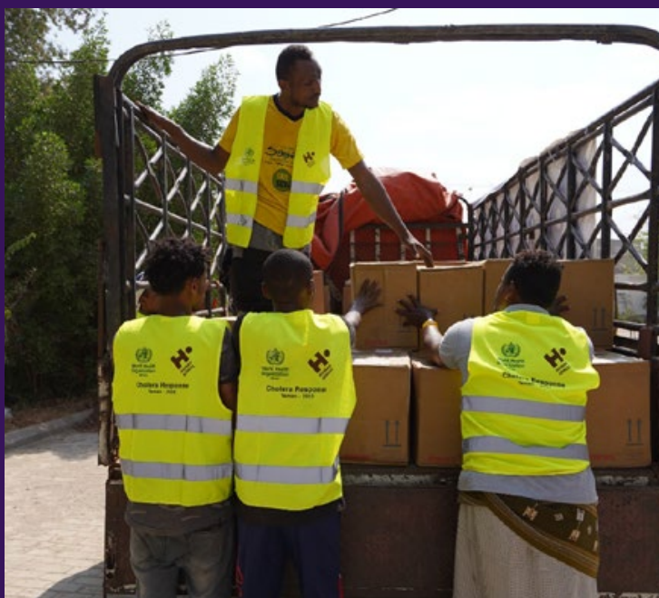
Essential medical supplies being delivered in Yemen.

In response to a notable increase in cholera cases in Aden, Yemen, Human Appeal Yemen collaborated with the World Health Organization (WHO) to provide critical medical supplies to various health facilities in the region. This initiative extended support to institutions such as the Friendship Educational Hospital, Sheikh Othman Health Facility, Al-Buraiqa Health Facility, and the Kabuta Health Facility. The donated medical supplies from the WHO, including oral rehydration solution and 40,000 water purification tablets , are anticipated to benefit approximately 250,000 people . This intervention aims to alleviate the severity and duration of cholera symptoms, contributing to improved health outcomes in the affected areas.