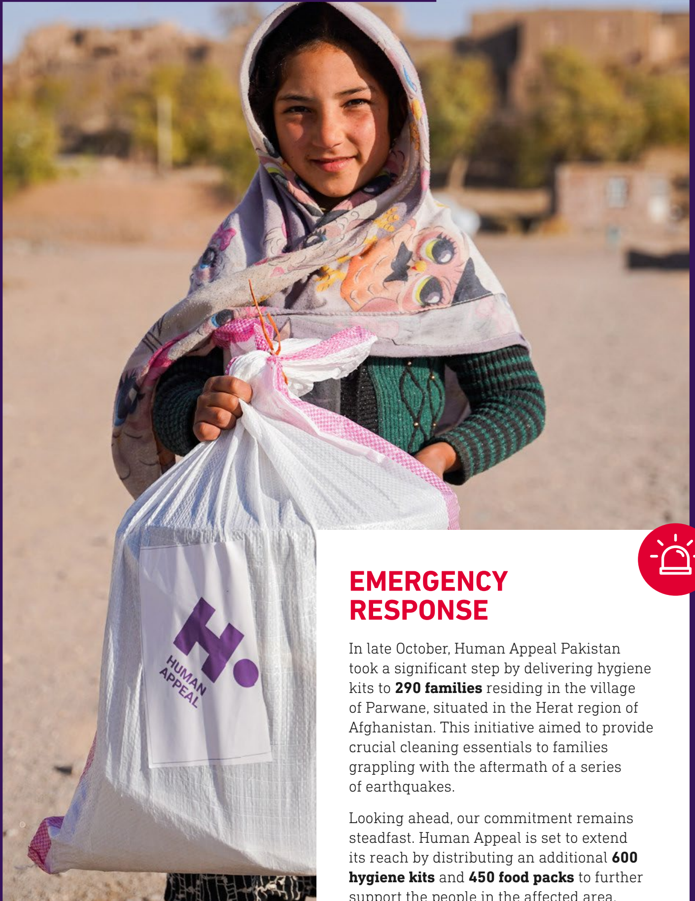
Afghan child holding one of the hygiene kits.