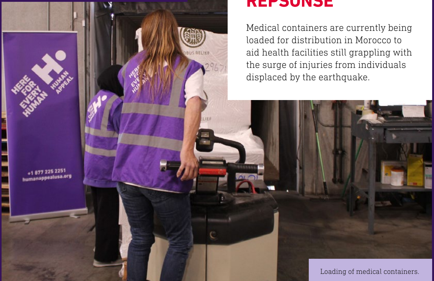
Loading of medical containers.

Medical containers are currently being loaded for distribution in Morocco to aid health facilities still grappling with the surge of injuries from individuals displaced by the earthquake.