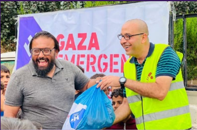
Important food distributions.