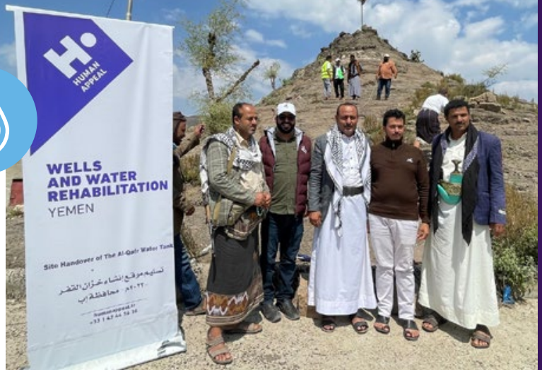
Group standing in front of the area where the water tank will be installed.