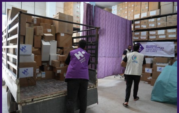
Medical supplies are distributed across northwest Syria.