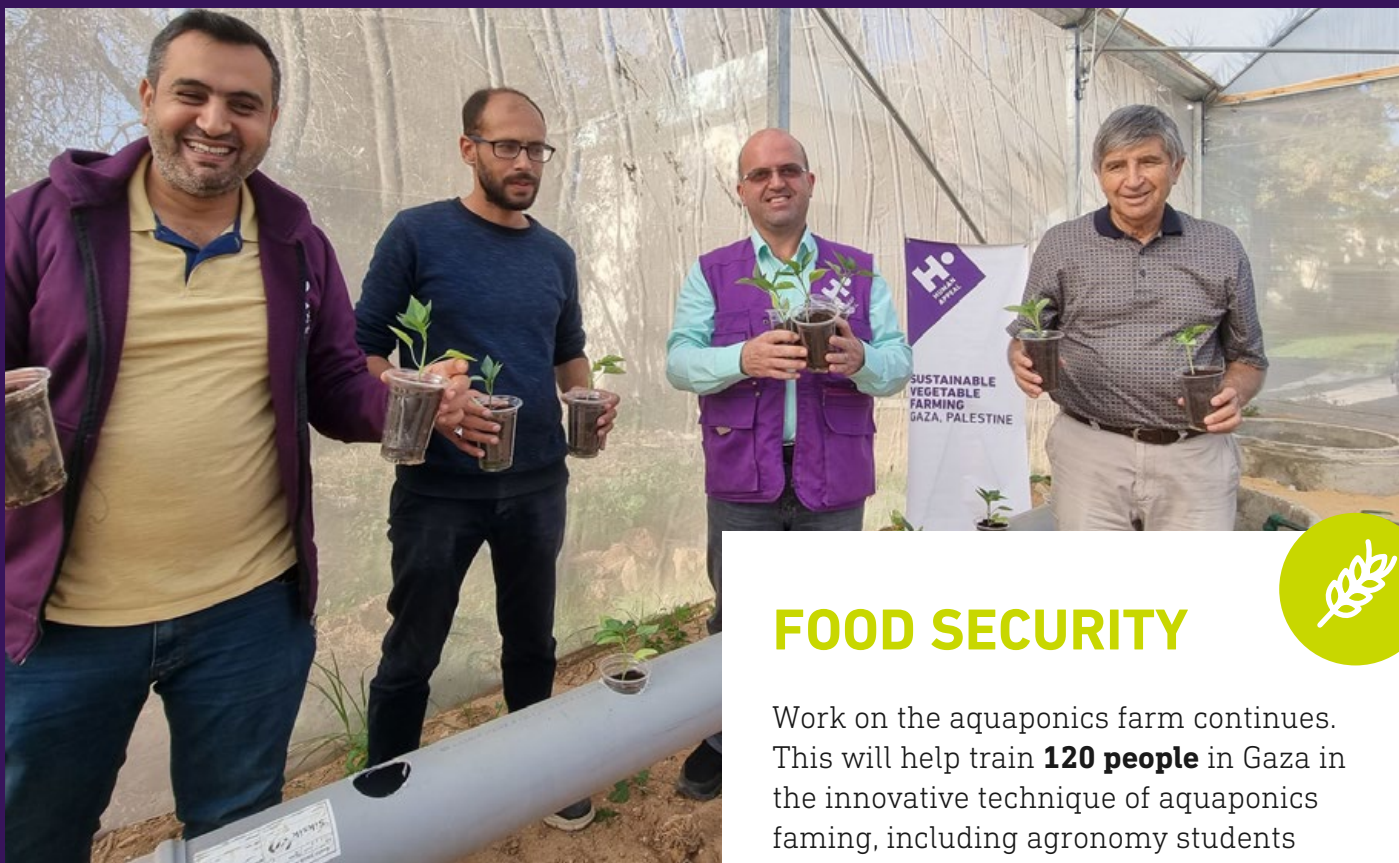
The aquaponics farm is underway.

We have almost finished renovating 70 houses that were damaged in the recent attacks in Gaza.