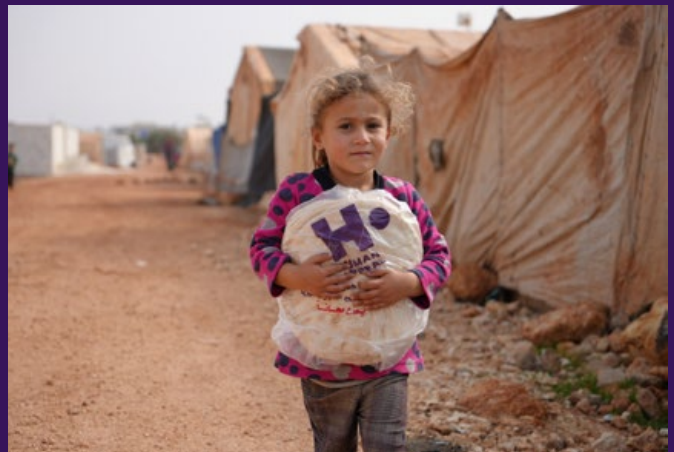
A young girl holds the bread as she takes it back to her family.