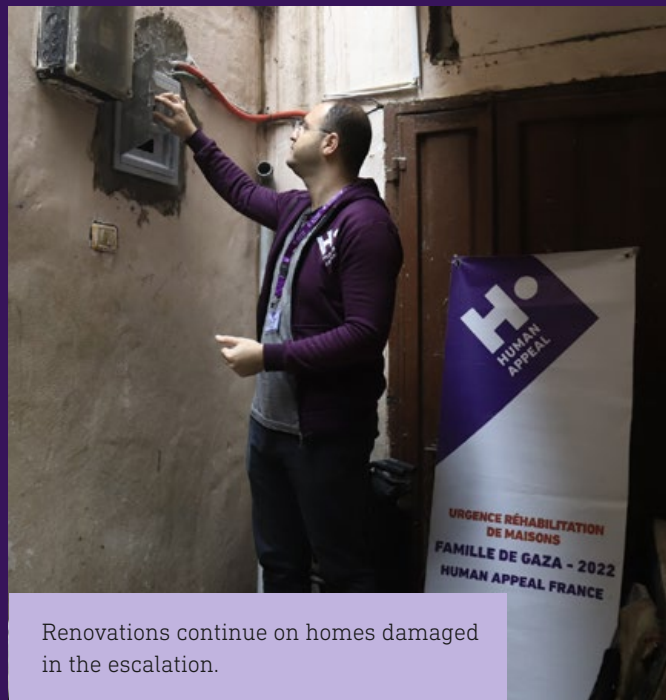
Renovations continue on homes damaged in the escalation.