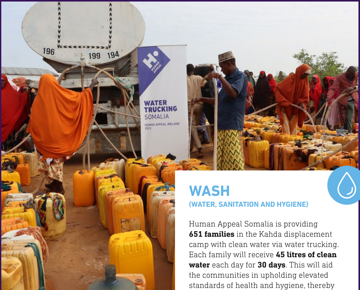
A water truck being used to fill water tanks.