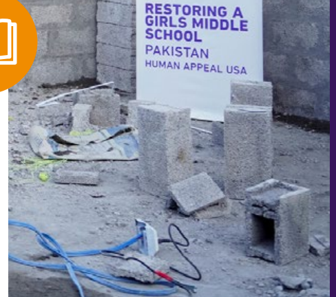
Work on the school in progress.

Human Appeal is working on restoring the middle school for girls in the village of Chitratopi, Kashmir in Pakistan. The school was destroyed by an earthquake in 2005, and only partially repaired. Human Appeal has begun a project to fully restore the school, with 14 classrooms , along with bathroom facilities. This initiative will enable the local children to study in a secure and comfortable environment, eliminating the need for outdoor classroom sessions.