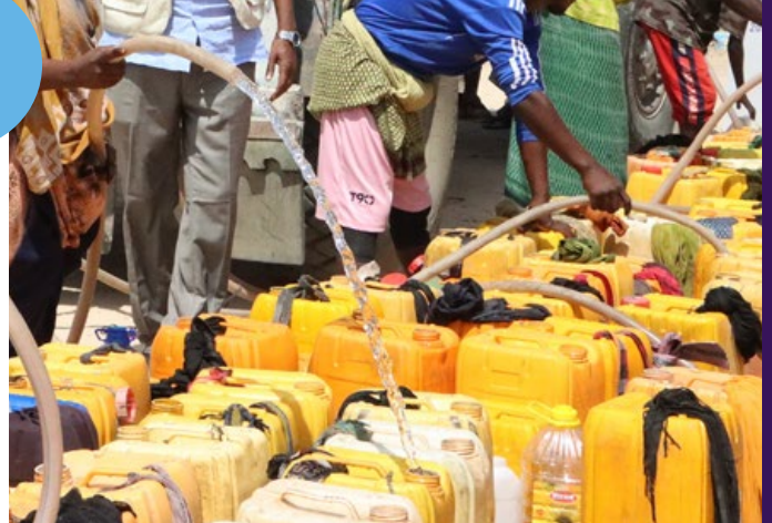
Families filling their water tanks in Deynile.

Human Appeal Somalia is providing clean water to the community of displaced families in Deynile via water trucking. Within a month, 128 households will see a significant enhancement in their access to clean and safe water, thereby contributing to the improvement of their health and overall well-being.