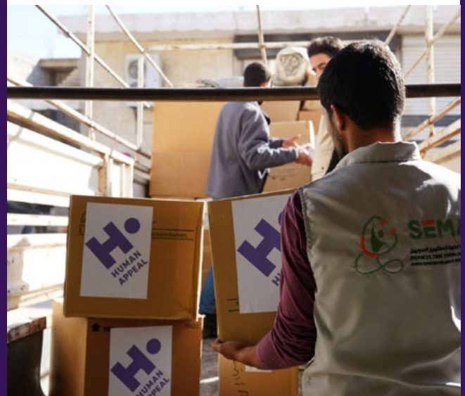
Medical supplies being removed from the truck for distribution.

Human Appeal has successfully distributed medical supplies from Globus Relief across several medical centres in multiple areas of north-western Syria. These supplies play a crucial role in addressing the scarcity of medical items in hospitals and health centres, which are grappling with increased demand during the winter season.