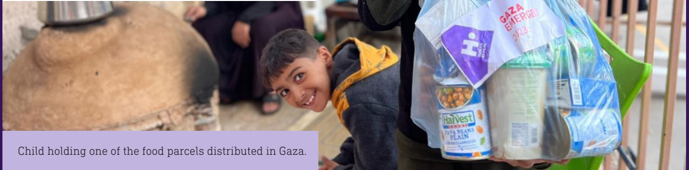
Child holding one of the food parcels distributed in Gaza.

On the 6th December, 1,000 food parcels were delivered to Khan Yunis in the south of the Gaza Strip where they were distributed amongst displaced families.