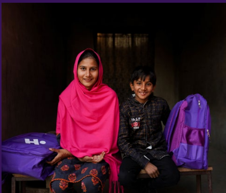
Children sitting with their Back to School bags.

Human Appeal provided Back to School kits to 300 children about to return to school after the winter break in the region of Faisalabad in Pakistan. Each Back to School kit is a brand new school bag, containing notebooks, pens, pencils, a geometry set, coloured pencils and a water a bottle. These kits will assist low-income families in ensuring their children can attend school without facing the difficult choice between purchasing food or essential school supplies.