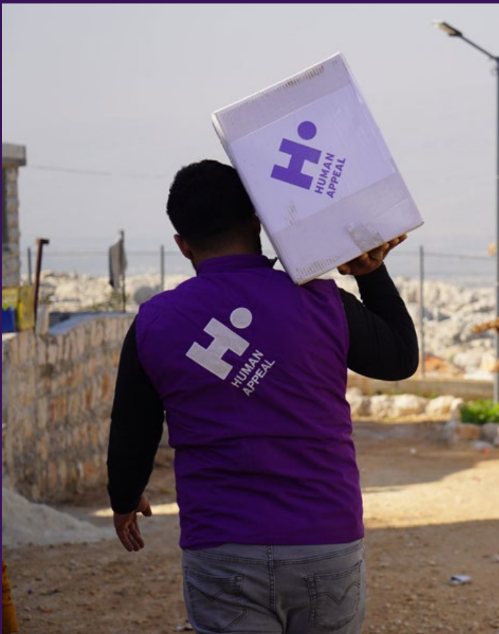
Food parcels being transported into the village.

Human Appeal provided food parcels to the residents of Al Zohoor village who were impacted by the earthquake in 2023. Despite the passage of months since the earthquake, numerous individuals are still grappling with the aftermath, having lost their homes and personal belongings. Al Zohoor, our second constructed town for displaced Syrians, accommodated 1,000 families within 100 hours of the devastating earthquake in early 2023. The distribution initiative commenced on December 19th, reaching 200 families . Each food parcel is equipped with essential items like lentils, rice, bulgur, pasta, dates, oil, olives, and flour, ensuring that a family has sufficient provisions to last for a month.