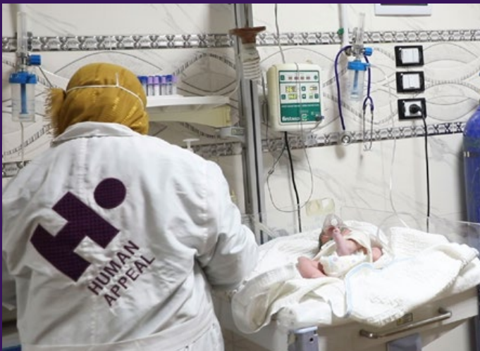
Baby in care at Al Iman Hospital.