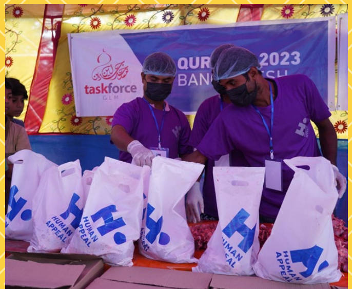
In Bangladesh, Human Appeal distributed Qurbani to 1,740 families , a total of 8,700 people .