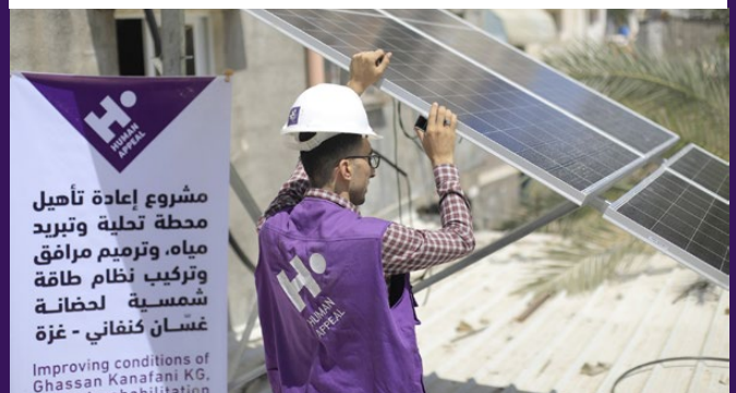
Rehabilitation of the kindergarten in process.

Human Appeal is undertaking the rehabilitation of the Ghassan Kanafani kindergarten by providing essential upgrades. These include a water filter unit capable of handling 1,500 litres, a cooled water dispenser, maintenance of sanitation facilities (like latrines), an upgraded lighting system, and the installation of solar panels. These improvements ensure that the children can attend the kindergarten without any issues.