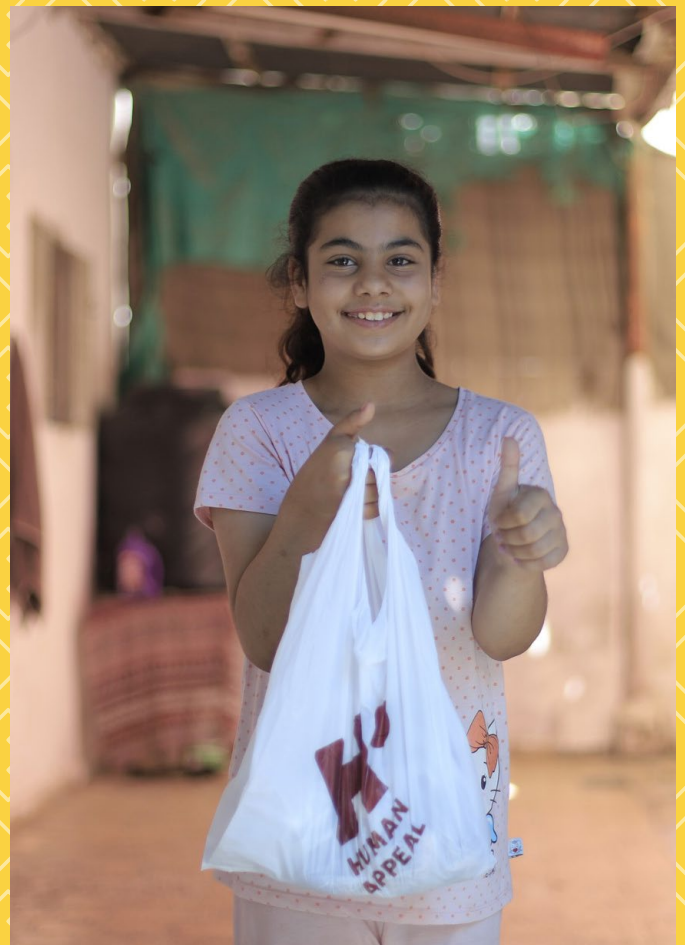
Human Appeal distributed portions of Qurbani meat to over 4,260 families living in the Gaza Strip.