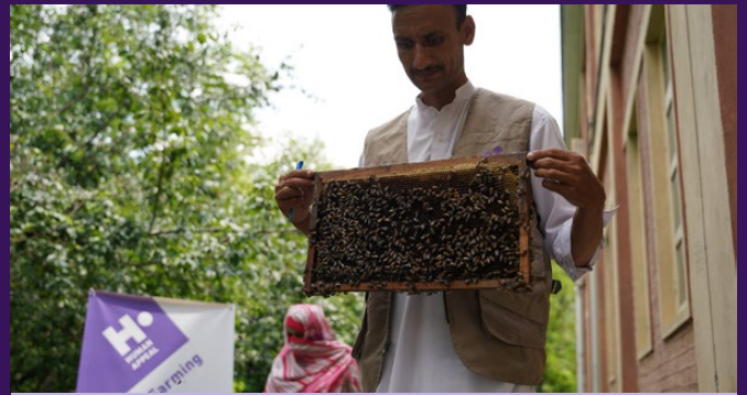
One of the trainees at the honeybee farming course.