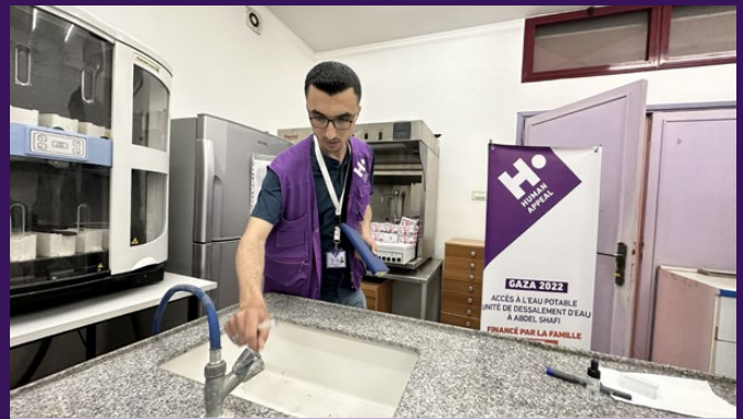
Checking the water infrastructure at the ASCHA.