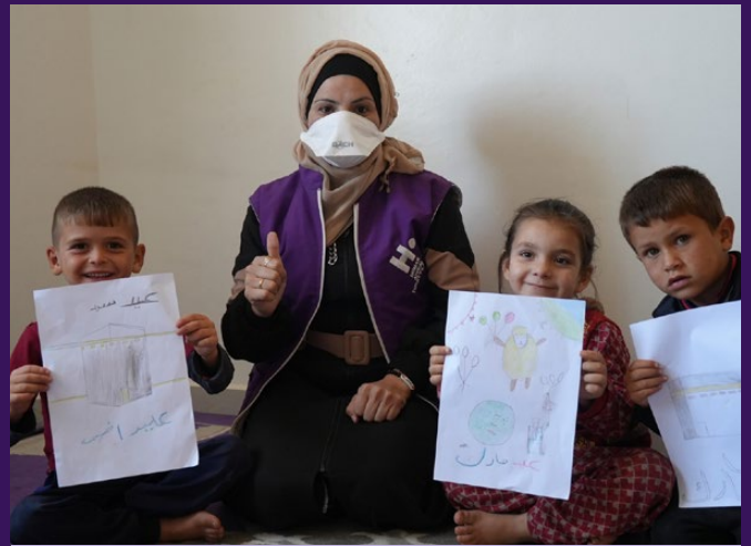
Children showing off their drawings.