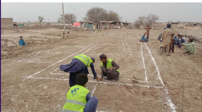
The positions of houses being marked out in the village.

Human Appeal Pakistan is building 113 secure homes in the village of Ghulam Hussain Chandio, which was badly affected by the flooding in 2022. The houses are one or two rooms, and they are built above ground level to improve their situation in future floods.