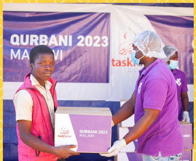
In Malawi, we distributed 19,648 portions of goat across 98,240 people .