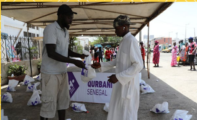
In Senegal, Human Appeal distributed Qurbani meat parcels to 5,040 families .