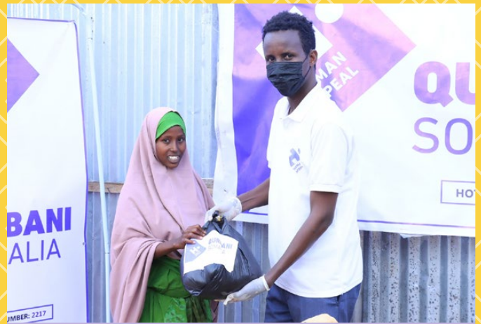
We distributed 22,860 Qurbani meat parcels to families living in the Kahda displacement camps, supporting over 114,300 people .