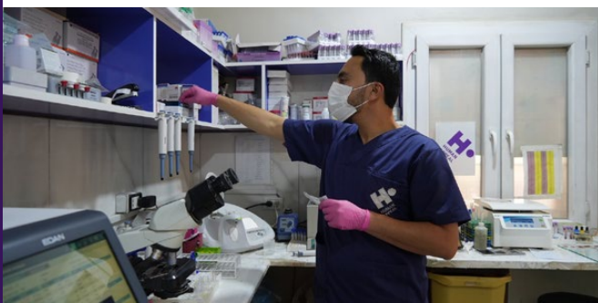
Medical work ongoing at Al Imaan Hospital.

In response to damage sustained during the February earthquakes, Al Imaan Hospital has been repaired and damaged areas have been rebuilt. In some of the areas that have been rebuilt, such as the incubator room, equipment has even been improved.