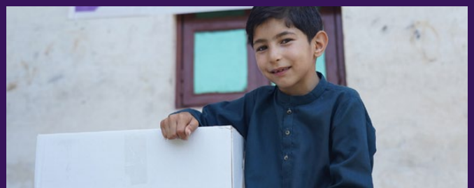
Pakistani child with his box of Eid gifts.

Human Appeal trained 30 people on honeybee farming in Dhirkot, Azad Kashmir, providing theoretical knowledge and practical experience in honeybee farming. At the end of their training, the trainees received four starter hives and necessary equipment to build a sustainable livelihood. The Honeybee Farming project has been active in Pakistan since 2009, and has been one of Human Appeal Pakistan's flagship projects, supporting and training 975 farmers since the start of the project, who have gone on to sell £1.5 million worth of honey.