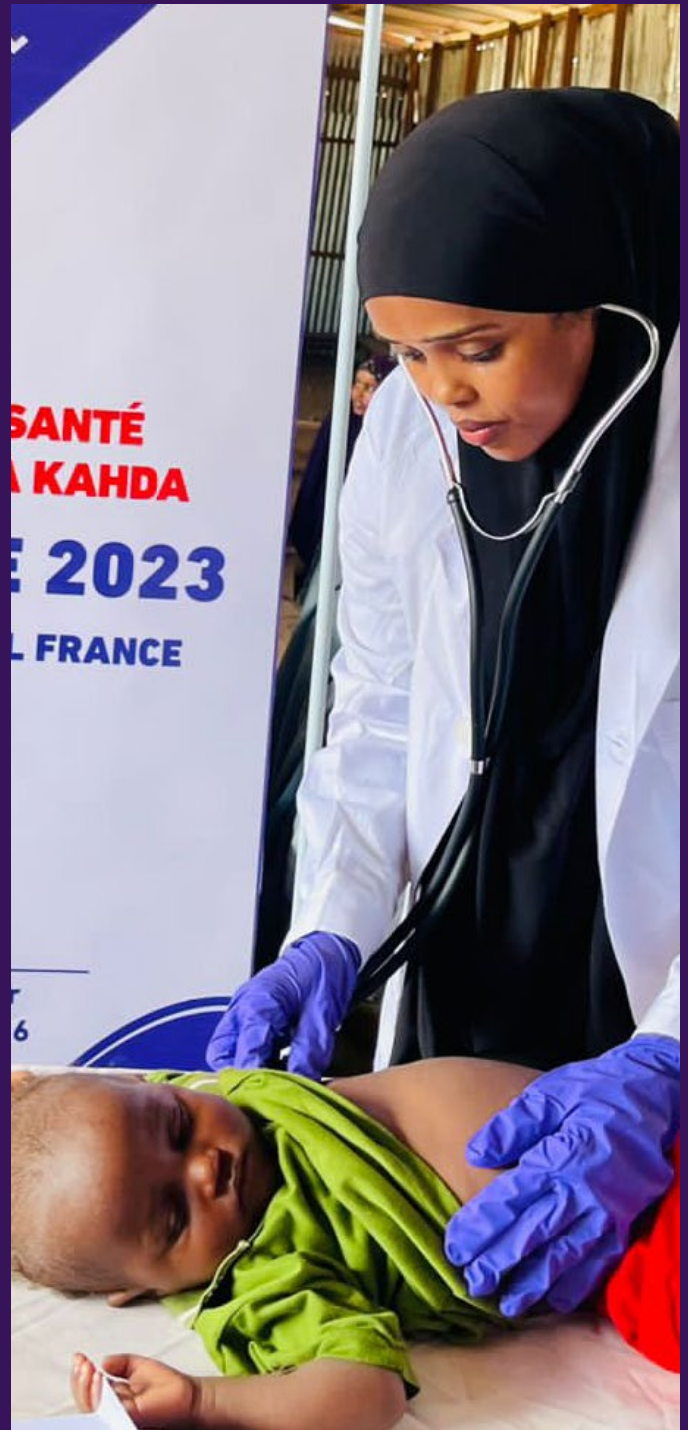
Child being examined at the healthcare centre.