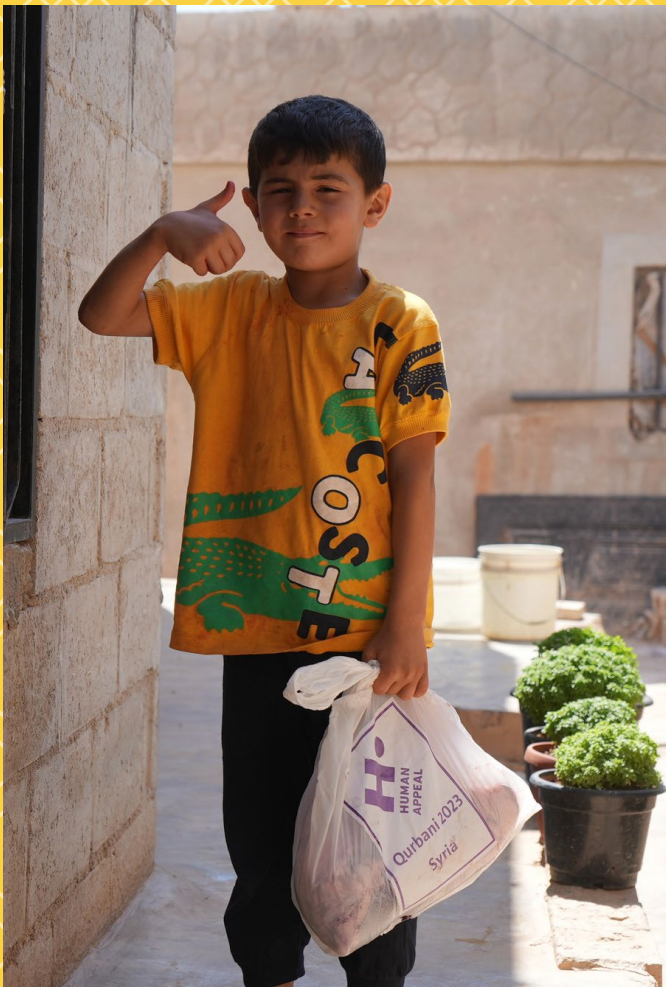
Human Appeal distributed 265 portions of Qurbani meat to families living across five displacement camps in Syria.