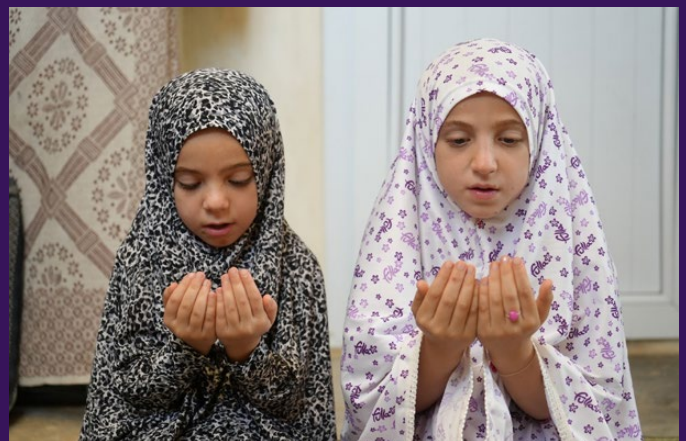
Children praying in Al Zohoor.

The Human Appeal team visited the psychological support clinics in Mashhad Rouhin and Mariam Health Centre, set up by Human Appeal, and met a number of children who drew these lovely images showing their understanding of both the holy month of Dhul Hijjah and the sacrifice of Qurbani.