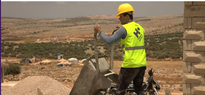
Construction work continuing in Al Zohoor.

In Al Zohoor town, Human Appeal is currently in the process of installing 176 light poles and constructing 25 rooms for firefighting and prevention. Additionally, we are continuing to pave the roads and address potholes, aiming to maintain Al Zohoor as a safe and livable town for its thousands of Syrian residents.