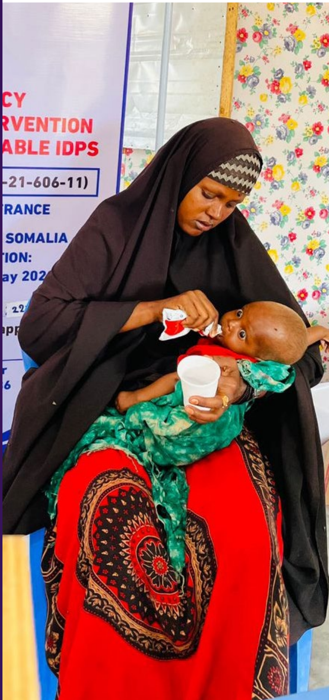
Child being fed a nutritional drink by their mother.

Human Appeal provided an Emergency Nutrition Intervention in Mogadishu's Kahda District over the blessed 10 days of Dhul Hijjah, offering free supplies and consultations.