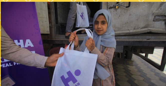
In Yemen, we provided Qurbani meat parcels to 8,874 families , including the visually impaired, people suffering from renal failure, and orphans.