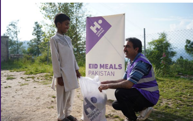
Staff distributing food parcels at Eid.

In Pakistan, we distributed 3,743 food parcels , each providing wheat flour, rice, cooking and other essential food items to thousands of family so they could celebrate Eid ul-Adha with filling meals.