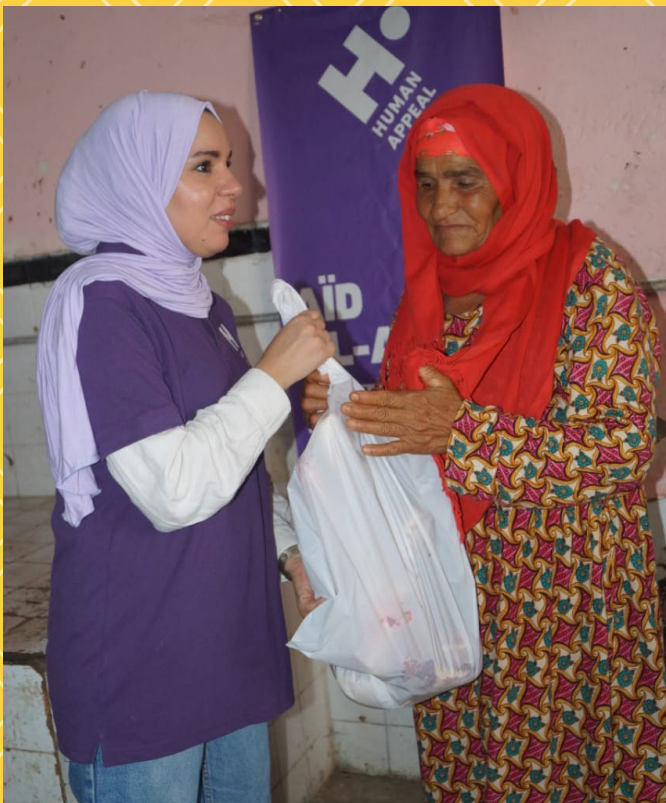
In Tunisia, our Qurbani programme helped 52,720 people with meat for their Eid meals.