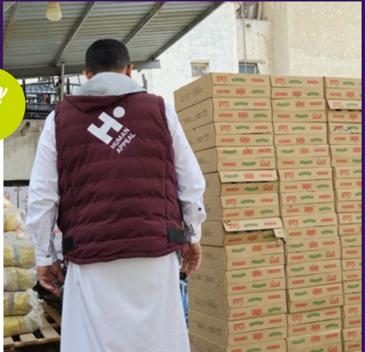
Food stacked up for distribution in Yemen.

Amidst the conflict, Human Appeal Yemen has distributed 128 food baskets to families affected by kidney failure. Each basket contains vital supplies including rice, sugar, flour, oil, dates, and salt, sufficient to sustain a family for a month. This assistance not only supports the health needs of these families but also helps alleviate financial burdens during these challenging times.