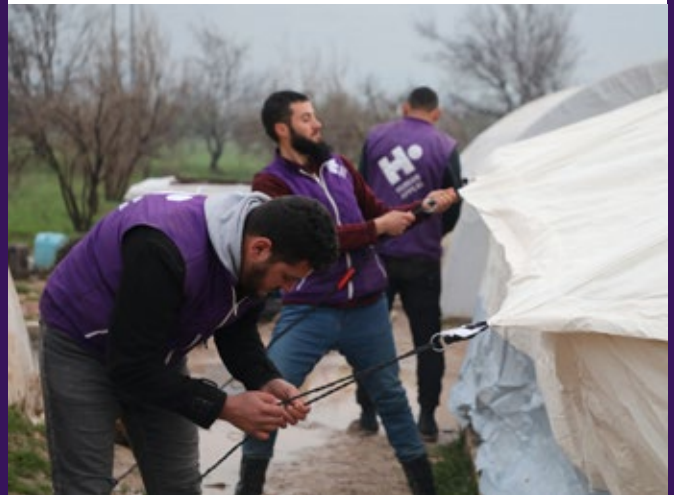
Our Human Appeal team setting up a tent following the rainstorm.

Following a rainstorm that struck several displacement camps in Aleppo in mid-January, damaging and flooding tents, Human Appeal distributed 40 waterproof tents to affected people in the Salet Media camp, and 10 tents in Al Eskan camp.