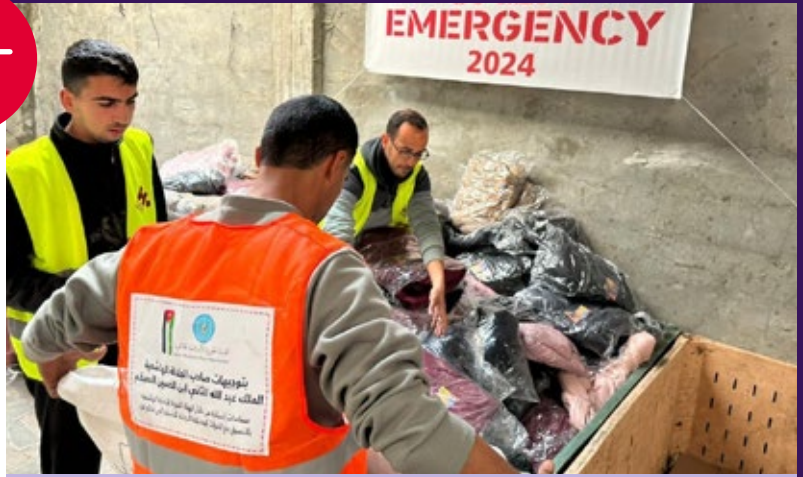
Newly arrived supplies being prepared for transportation.

Working with Jordan's Hashemite Charity Organisation, we shipped three containers of humanitarian aid to Gaza - includes 12 pallets of food, and 32 pallets of winter clothing to help displaced families stay warm and nourished.