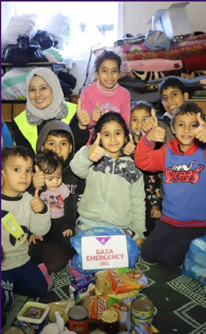
Children at the shelter school with the food parcels.