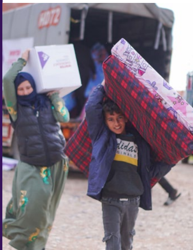
Food parcels and mattresses being carried by a mother and child.

We distributed 390 food parcels and 780 mattresses to 390 families in Lebanon, who also received warm blankets.