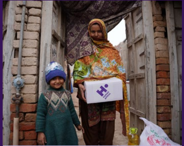
Food pack containing supplies for Pakistan families.