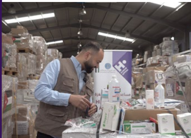
Checking medical items for the people of Gaza

Over the last month, our team has been working to pack over £1 million worth of food, medical supplies and winter items at Amaan Airport in Jordan, to be airlifted to Egypt, where it will enter the Gaza Strip via the Rafah Crossing.