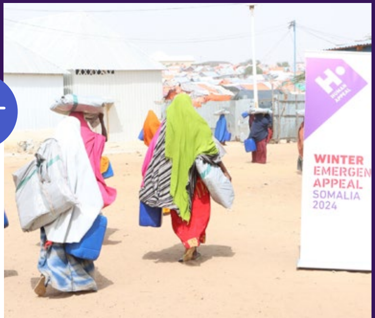
People carrying essential winter supplies

In the Kahda region, Human Appeal Somalia has provided essential winter supplies to 101 recently displaced households . Each household received crucial items including one plastic sheet, one sleeping mat, two blankets, one mosquito net, and one jerrycan to help them cope with the harsh winter conditions.