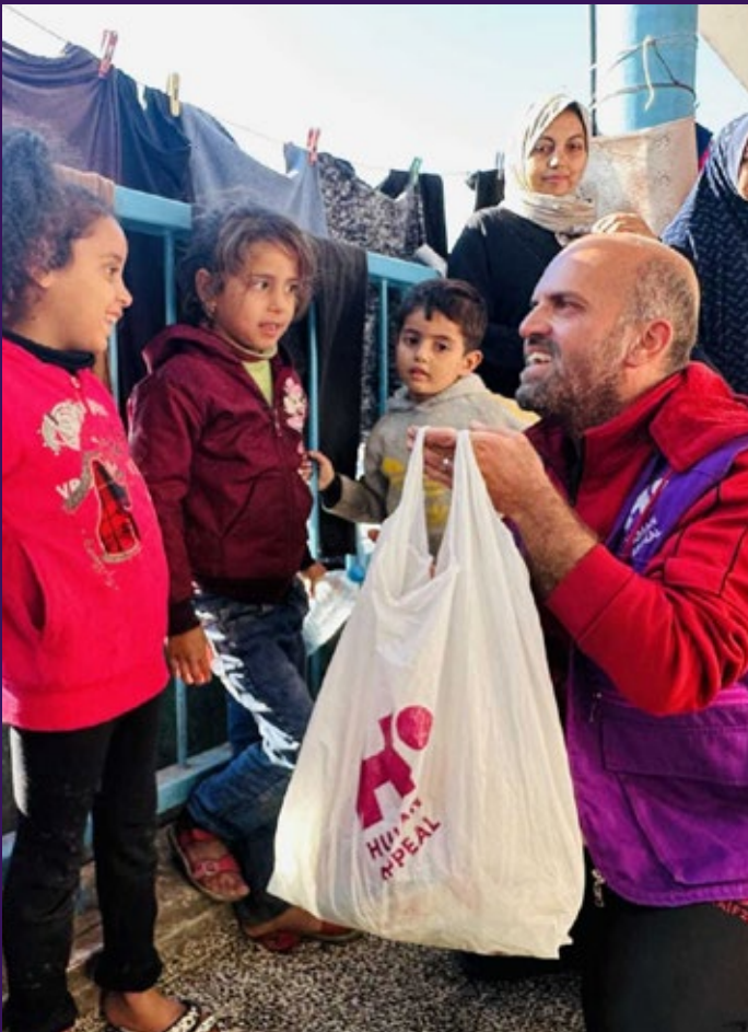
Child being given a bag of new clothes.

In collaboration with multiple charities, 85 pallets of food supplies have reached the Gaza Strip, where they will be transported to the Human Appeal warehouses and subsequently distributed to families currently residing in the shelter centres within the strip.