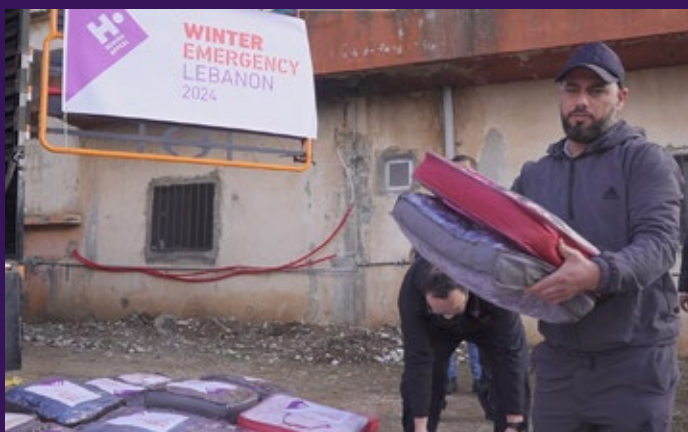
Blankets to help families stay warm in Lebanon.