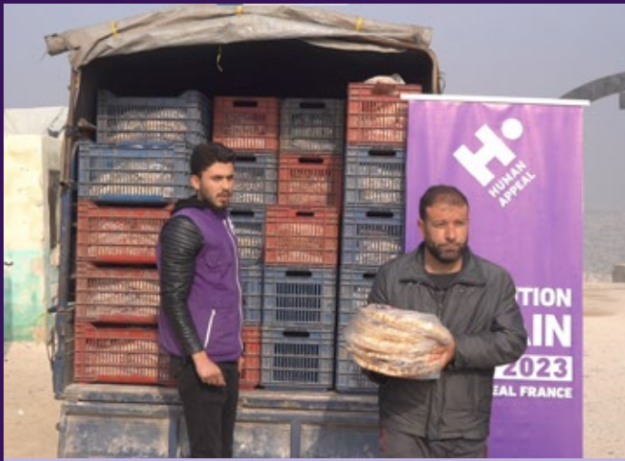
Bread distribution underway in displacement camps.