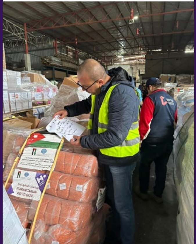
Supplies being organised in the Human Appeal warehouse.

We delivered 500 sets of women's winter clothes, and 500 sets of winter clothes for children to a school in Khan Yunis, ensuring that families sheltering there can stay warm in the winter chill.