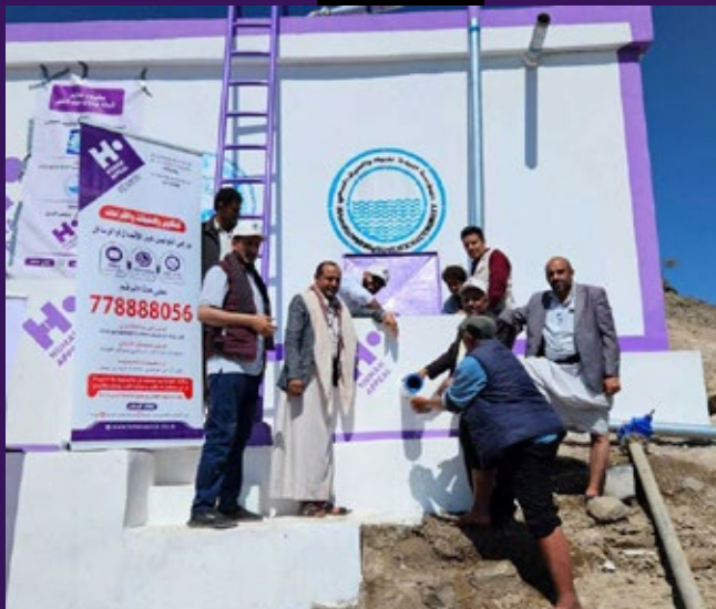
The completed Al Qefr water tank.

Human Appeal Yemen distributed food parcels to orphans and their families in Sana'a governorate, thanks to funding from Inspire FM.