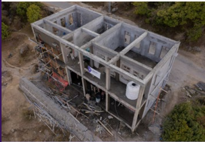
Chitratopi school under construction.

Human Appeal remains committed to the ongoing renovation and enhancement of the Girl's Middle School in Chitratopi. Through our efforts, we aim to provide a secure and conducive environment where local girls can access a high-quality education.