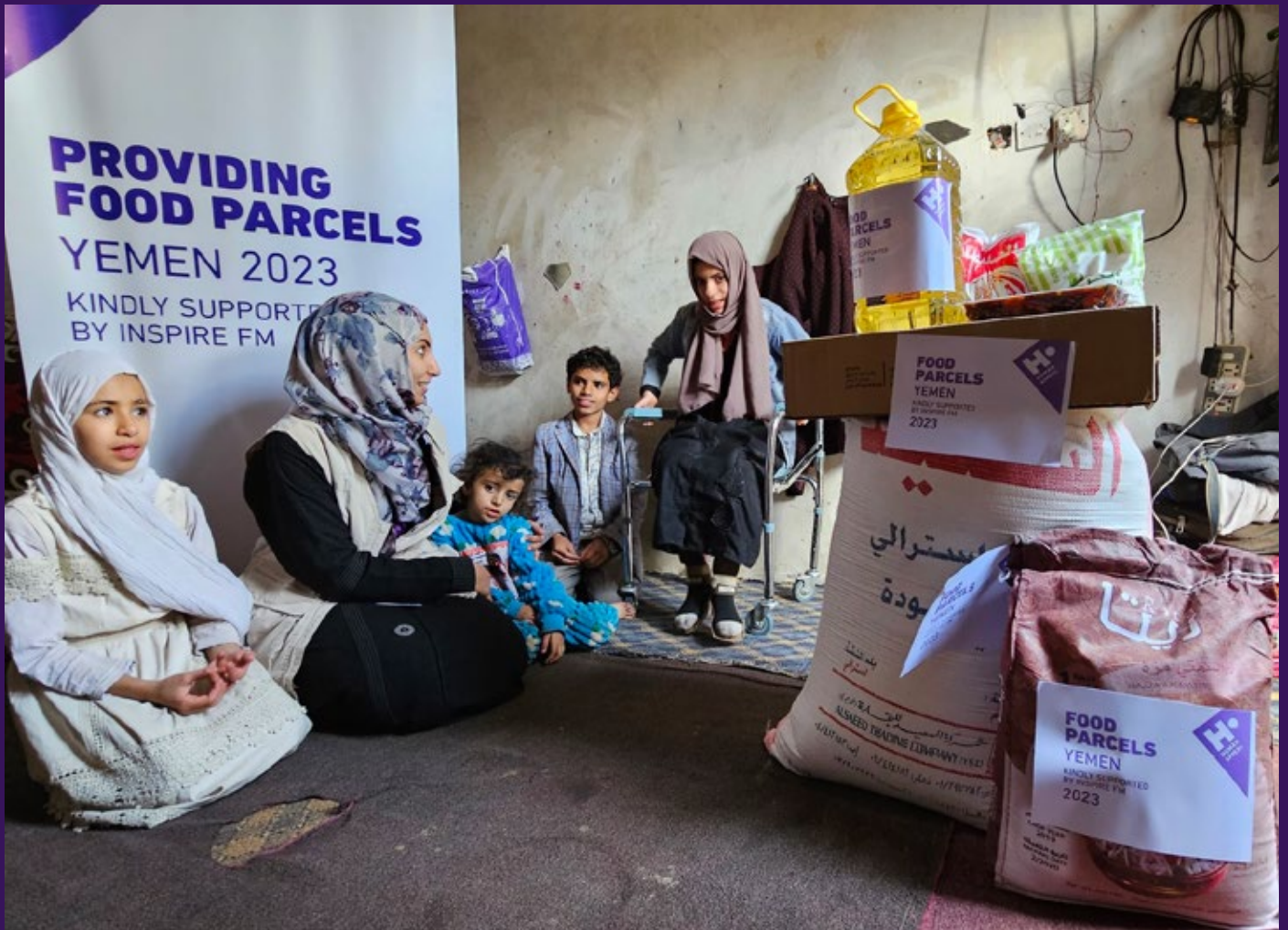
A family sitting with a food parcel in Yemen.