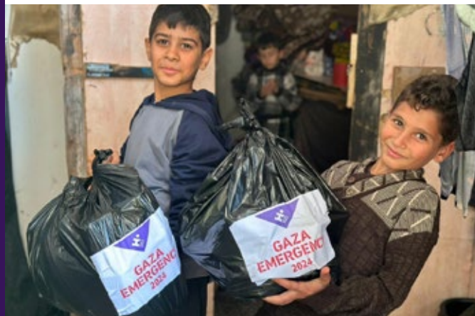
Children holding bags containing food parcels and hygiene kits.

In the region of Deir Al Balah, we distributed 230 food parcels and 230 hygiene kits , supporting families in shelter schools with essential needs.