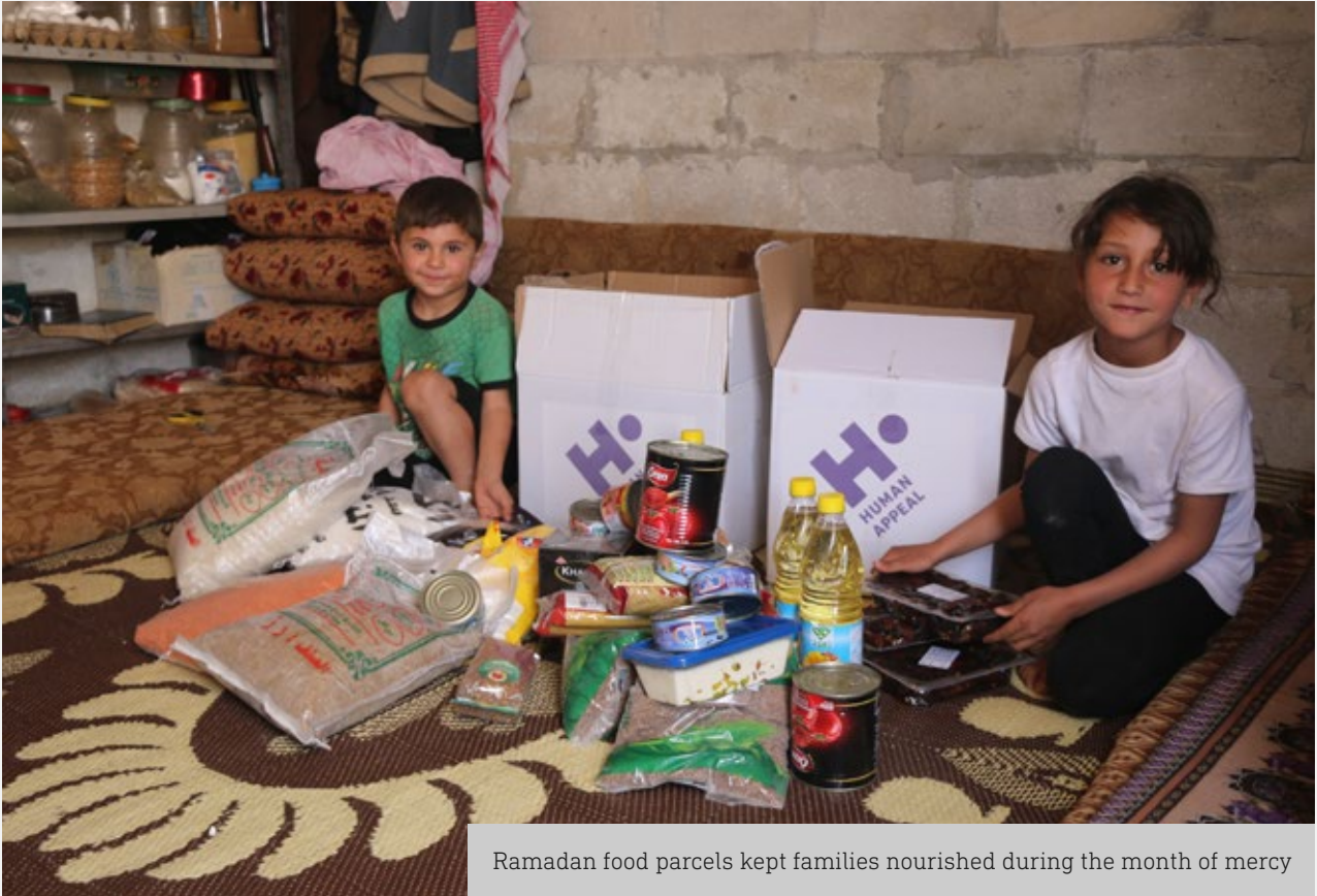
Ramadan food parcels kept families nourished during the month of mercy