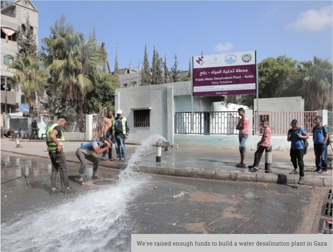
We've raised enough funds to build a water desalination plant in Gaza