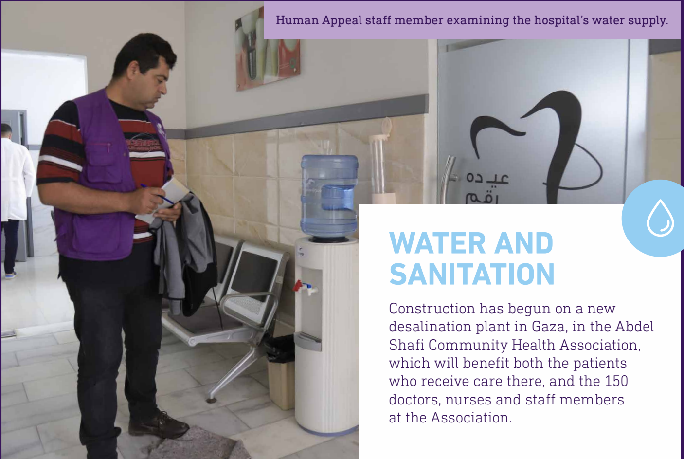
Human Appeal staff member examining the hospital's water supply.