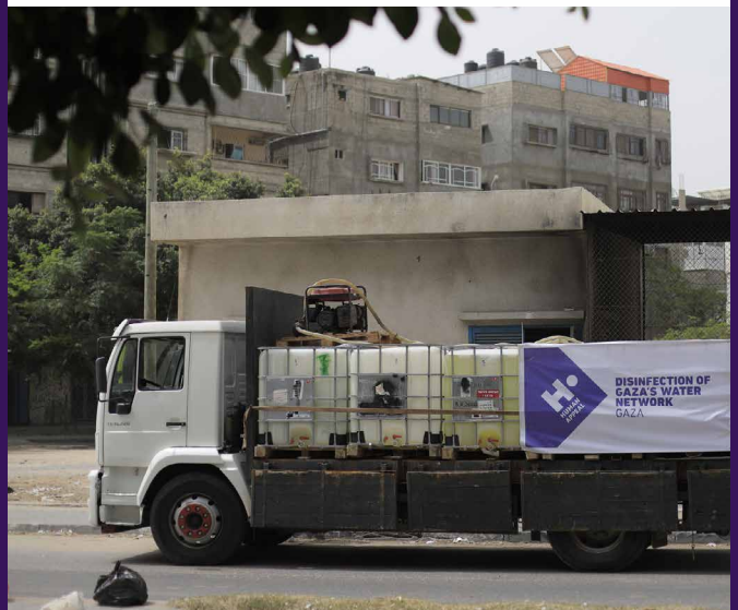
Truck carrying disinfectant materials.

We distributed over £40,000 worth of medicine and medical disposables to hospitals across Gaza to help them keep their services running following the violence in May, which badly stretched already limited medical supplies.